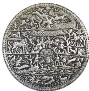
Figure 2. The delineation of Lacus Pelso on Seuso Treasure

The hydrography could be analysed in two aspects: both micro- (the examination of the direct environment of the villas) and macro-level (the hydrogarpahy of the complete Balaton-Highland, and the changes of the shoreline of the Lake Balaton) researches are needed. Also historical maps from the later ages (for example the maps of the First, the Second and the Third Military Survey from the 17-18 th Century; Fig. 2-3 ) could help the determination of the fountains and former brooks and rivers: the contour lines could draw the lowest points and lines, which were possible brooks.