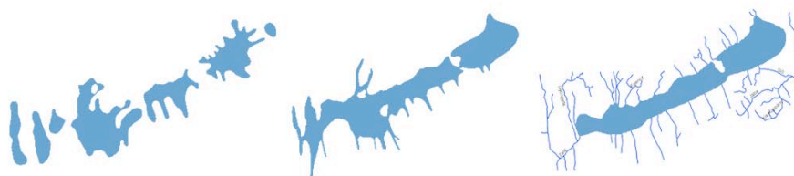
Figure 4. The Lake Balaton in Pleistocen, in Prehistoric Ages, and nowadays

So the Romans choosed the location of the villas by nearness of the water, furthermore forest, which gived timber, as well road network to the Trade, and they liked the nice panorama (for example the Lake Balaton; Fig. 5 ).