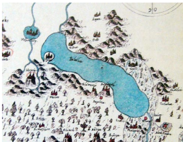
Figure 3. The Lake Balaton on Historical Maps

At the hydrography on micro-level, it can be said that every villa was built beside fountains, and laid on an offset lifted from its own environment against floods. So in indicating the places of the villas, the proximity of water was a necessary factor; water was made use of in as many forms as possible: watering, drinking water, watering animals, furthermore, to operate the baths of the villas.