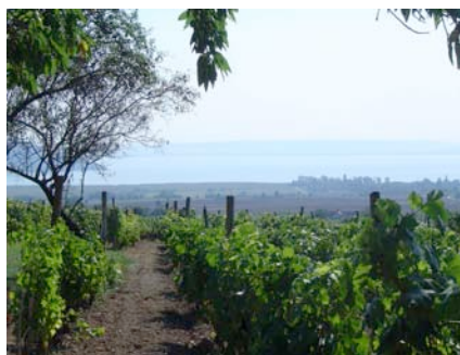
Figure 1. The Lake Balaton nowadays

The Lake Balaton is the biggest lake in Central Europe, it has 232 square mile water surface. The length is 78 air kilometres, the width is 4,5-12 km. The depth of the water is on a par only 3-4 metres ( Fig. 1 ).