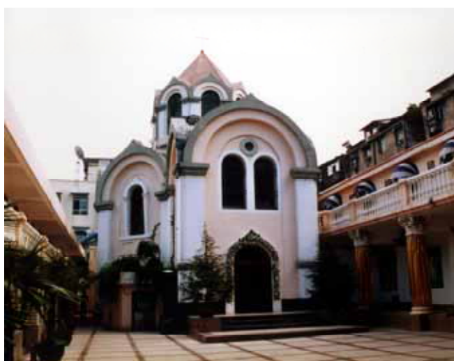
Fig13 Russian Orthodox Church in Hankou