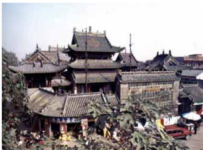
Fig 14 Shanshan Club Building in Sheqi