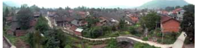
Fig.7 Yangludong Ancient town