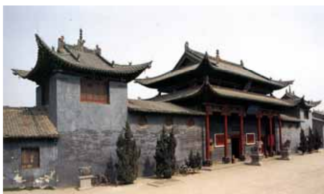
Fig 15 Shanshan Club Building in Luze Luoyang