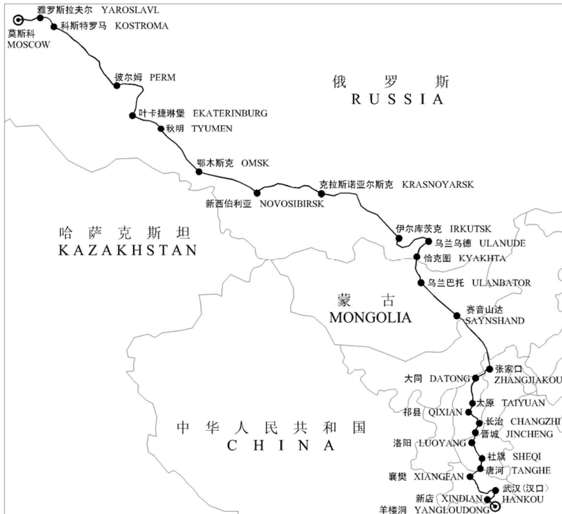
Fig.6 The Route of Tea Road