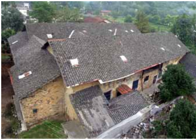
Fig8 Yangloudong Tea Factory Plan