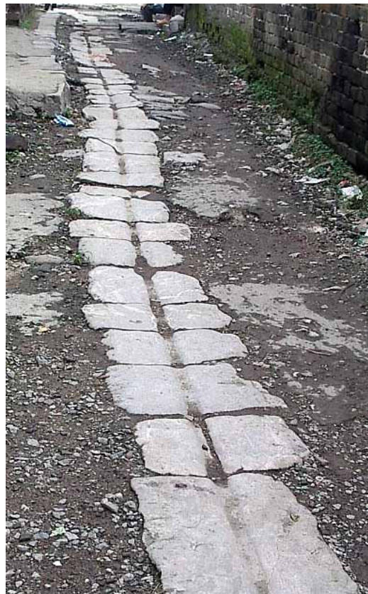
Fig. 3 Jigongche Vehicle Trace