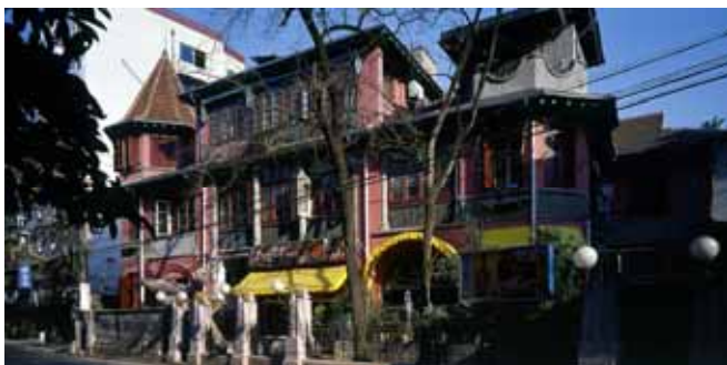
Fig10 Russian Litvinoff Residence