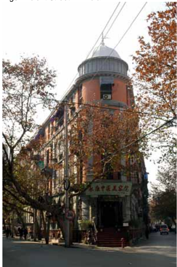
Fig11 Hankou Bagong house