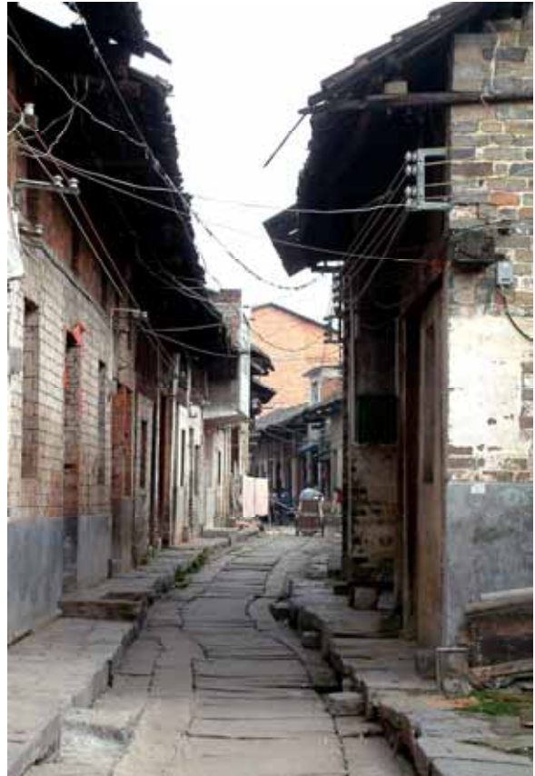
Fig9 Ancient Street in Xindian