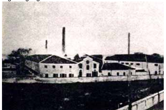
Fig. 4 S. W. Livinoff tea factory