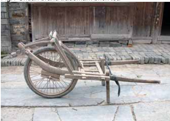
Fig. 2 Jigongche Vehicle