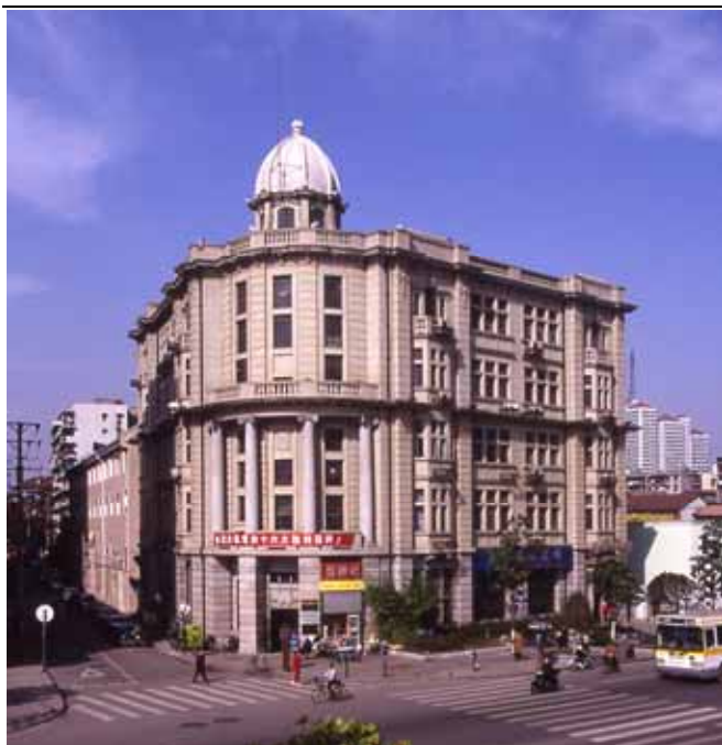
Fig12 Russian TokmaKoff. Molotkoff & Co. Building