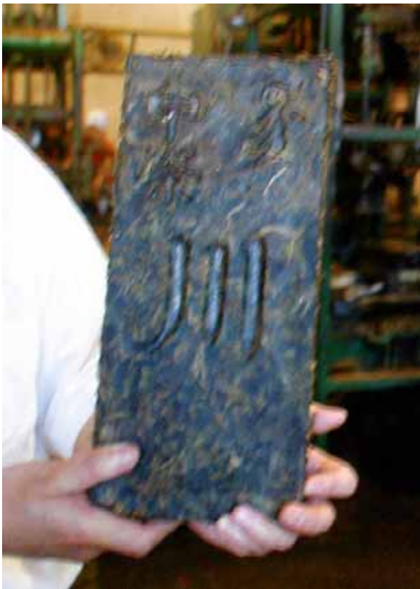
Fig.1 Chuan brand trademark brick tea

Wuhan University of Technology School of Architecture