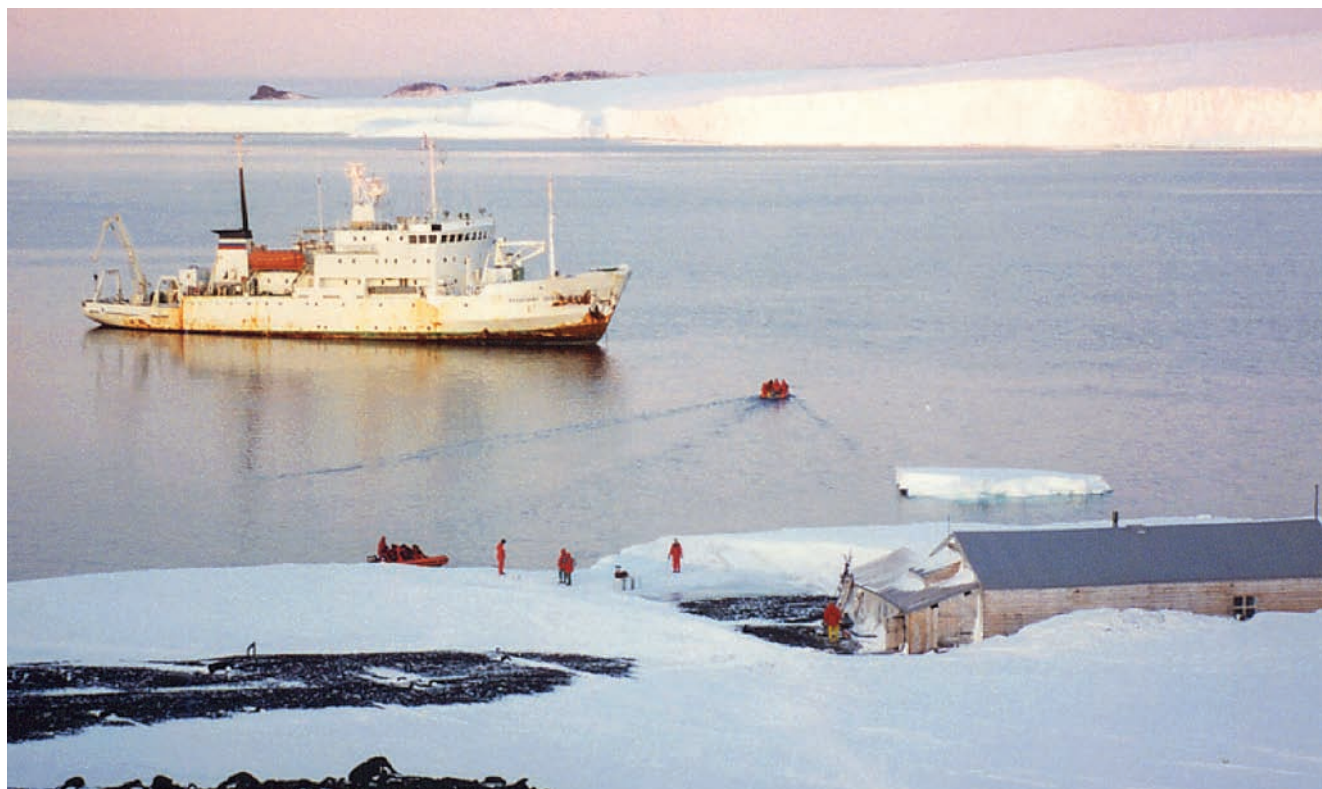
Scott's hut at Cape Evans is located on a shingle beach less than 50 metres from the water's edge and no more than 2 metres above high water level. Little more than a kilometre to the north the Barne Glacier terminates in a massive wall of ice up to 50 metres high that floats out onto the sea.

in the hut, but the expansion effect of freezing is further source of mechanical damage to structural materials and objects in the hut.