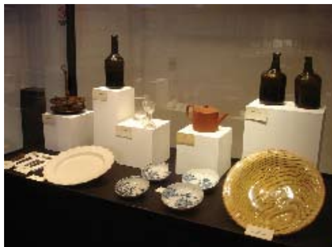
Figure 1: One of the display cases of the HMS Swift exhibit at the Mario Brozoski Museum in Puerto Deseado

More than two centuries later the challenge of trying to find the remains of the Swift was faced by a group of high school students from Puerto Deseado. They agreed that if the shipwreck was ever found, all its contents would be kept in the town as part of the local historical heritage.