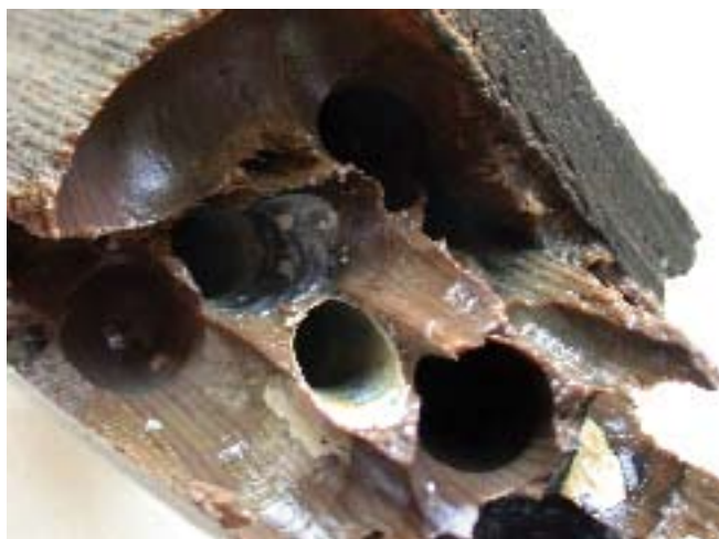
Figure 3: Wood fragment recovered from the Swift showing the severe damage caused by the action of marine borers

currents, marine biological agents and sediments. Sadly, there is clear evidence of the attack of marine wood borers in many of the timbers which are part of the ship's structure and furniture.