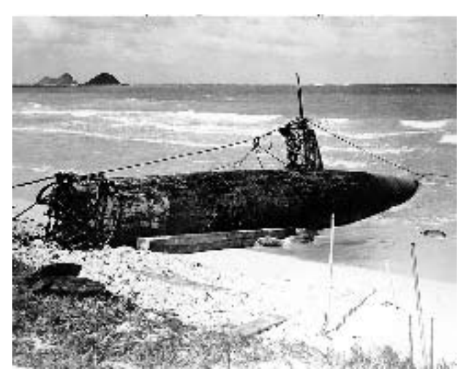
Figure 3: Sakamaki's midget sub HA-19 ashore on Oahu, December 8th, 1941

of State and the Government of Japan. On February 12th, 2004, the Government of Japan and the US exchanged diplomatic notes agreeing that: the US owned and controlled the midget sub; the site should be respected as a war grave as well as an historic resource; it should be protected and managed in accordance with international law, US historic preservation laws, and the US Policy for the protection of Sunken Warships (January 19th, 2001); and that under the maritime law of salvage the US, as the owner, is exercising its right to preserve its property where it has been discovered, and provides notice that it should not be salvaged or disturbed in any manner without the express authorization of the owner.