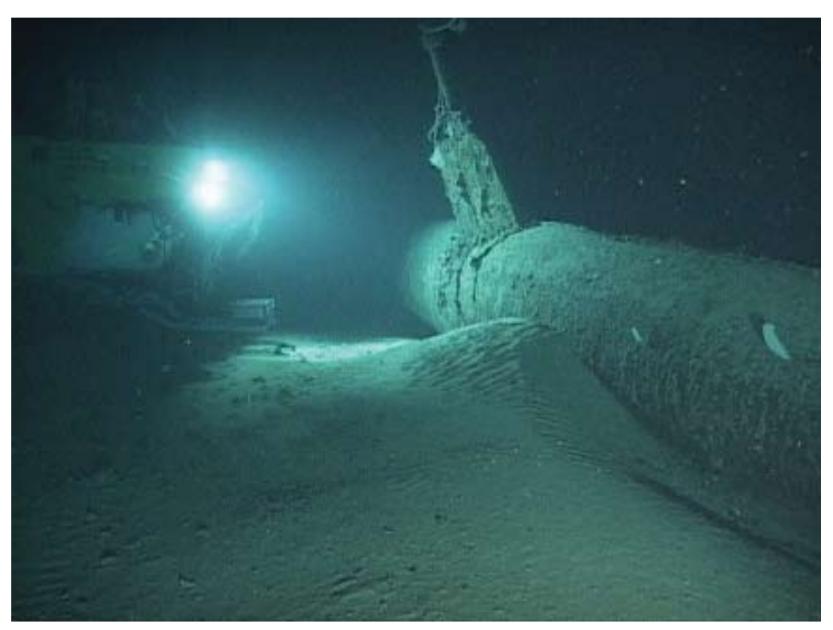
Figure 1: Portside of midget sub and HURL research submersible Pisces V