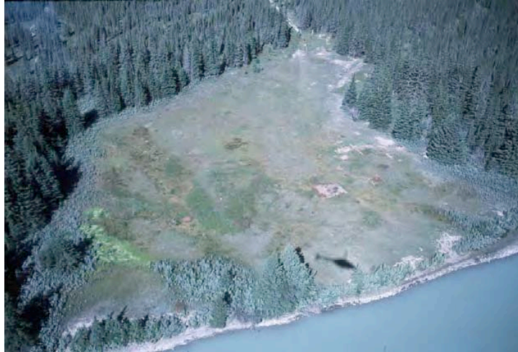
Figure 1. The designated place of Jasper House National Historic Site of Canada is defined by the edges of the forest clearing. The trail leading westward into the mountains is visible at the top of the photo

For visitors, the site is not easily accessible. Although located only a few kilometres from the town of Jasper, the major community in the national park, the site is not on a main road. The Canadian National Railway line is located west of the site but no public hiking trails or roads are connected with the rail corridor. Because of its isolation, there is no extensive interpretation on the site. The official Historic Sites and Monuments Board of Canada plaque is across the river at a pull-off on the main road through the national park.