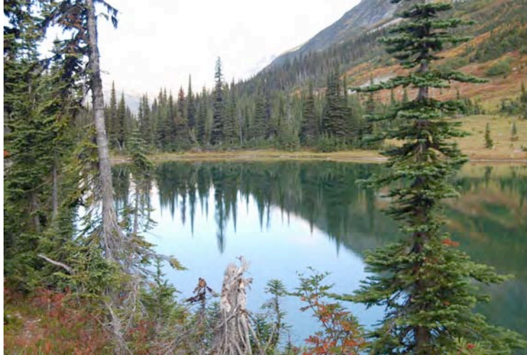
Figure 4. The feature of the summit of the pass is three small mountain lakes. The central lake is situated on the watershed and provides the source for both the Athabasca and Columbia Rivers. At one end water flows to the Arctic Ocean, and at the other to the Pacific.

Like Jasper House, the pass has few visible resources associated with the fur trade. The reward for the visitor is an amazing landscape. It is this that provides the experience; the “spirit of travellers gone past” (“Athabasca Pass Log Book” entry, August 28, 2007) captures the imagination of visitors. Another visitors’ box is available to present interpretive material, and a logbook invites them to comment on their experience. Comments reflect that many are moved by the legend of David Thompson, one of the best-known fur traders and explorers and the first European to cross the pass. Many travellers express the sense they are walking in the footsteps of the determined explorers who have gone before. The story of the famous toast at the Committee’s Punch Bowl is legendary; many visitors recorded that they have repeated this ritual with a symbolic toast, as a prize for obtaining the summit and stopping in a spectacular place.