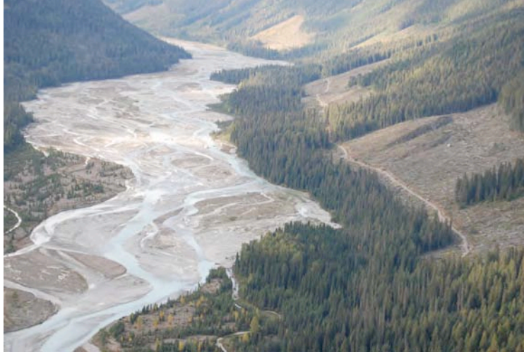
Figure 3. The Athabasca Pass follows a series of rivers.

series of paths whose use varied depending on the season (the depth of the snow, the height of the rivers) and the weather. Ascending from the east, travellers followed the course of the Whirlpool River and tributaries to the summit and then descended along Pacific Creek to its junction with the Wood River (HSMBC, July 2005).