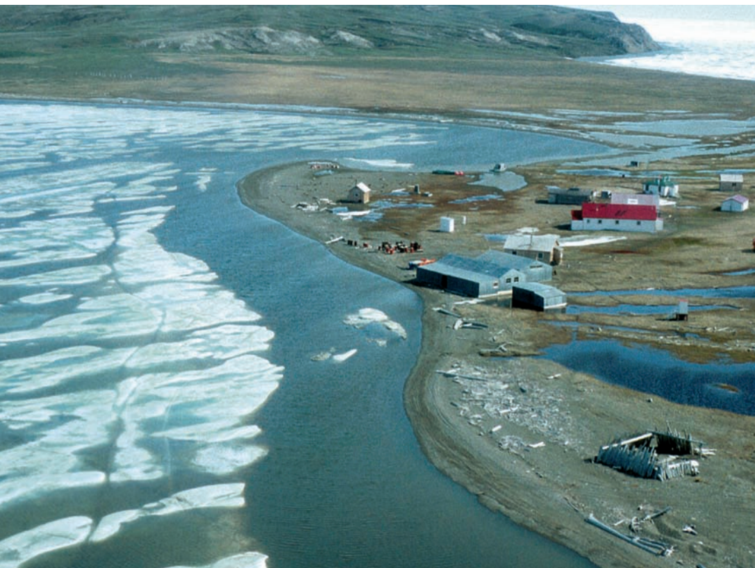
June, 1991 aerial photograph of the Historic Settlement Area with the Northern Whaling and Trading Company (NW&TCO) Store near the shore at centre left and Pauline Cove at right

Permafrost and ice lenses are found below ground throughout the island. Solifluction; the downward slumping of the thawed, active layer of soil over the frozen ground beneath has caused coffins to tumble and be pushed out of the ground on the south facing slopes behind the Settlement Area. This deterioration of the permafrost, coupled with a predicted increase in precipitation will inevitably effect the hydrologic regime and surface runoff rates and patterns.