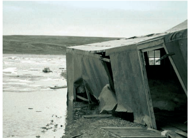
June, 2001 - the NW&TCo Store shed addition after being crushed by sea ice the previous fall