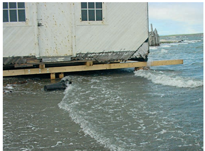
July, 2003 - the NW&TCo Store after the shed addition was removed and the building raised (Credit: Government of Yukon Territory)

August, 2003 - the NW&TCo Store after being moved five metres back from the shore. This building and the Canada Customs Warehouse and Hunters and Travellers Cabin to the left had to be moved an additional five metres in the summer of 2004 (Credit: Government of Yukon Territory)