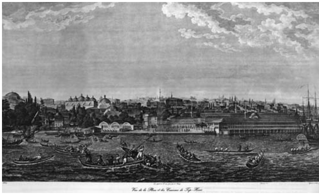
Fig. 15 Tophane (Melling's Panorama 21, 1819). This panorama presents the Tophane place situated on the European shore of the Bosphorus with vast barracks and other representative still existing buildings: the Kılıç Ali Paşa Mosque built by architect Sinan, the Tophane fountain (1732) and the gunfoundry vaulted with six domes. It forms a highly representative urban prospect and scenery of the distinguished residential Pera quarter including the harbour with splendid ships in the foreground