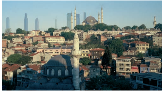
Fig. 11 Haydarpaşa and Süleymaniye Mosque seen from Zeyrek Terrace (simulation). The colossal Haydarpaşa site would appear from Zeyrek Terrace in the range of the Süleymaniye Mosque degrading the venerable silhouette and aura of the cupola and four slim minarets. (The Haydarpaşa towers are presented in a calculated scale). The Haydarpaşa Project will be visible from Galata Tower as well as from Galata Bridge and might even appear as a monster project in the view from Cihangir Mosque Garden. It was Yahya Kemal who in a poem perpetuated this famous view from Cihangir to Üsküdar at sunrise.