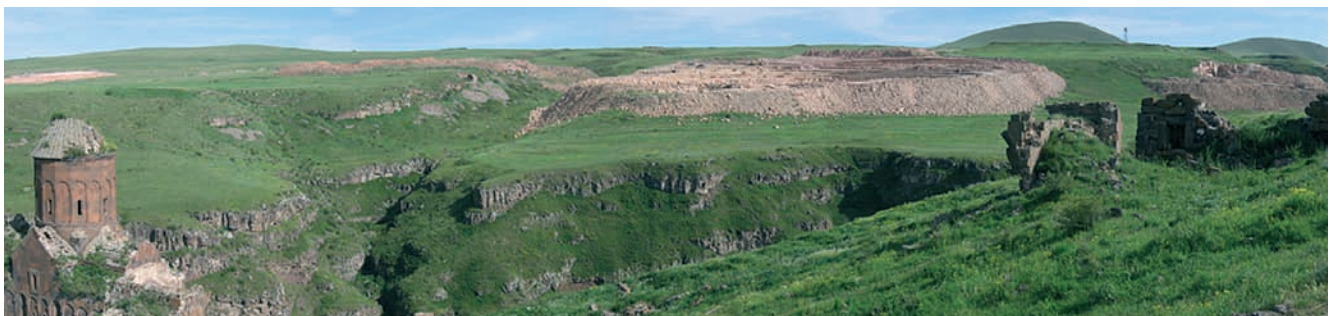
View of the historic site of Ani and the quarries nearby