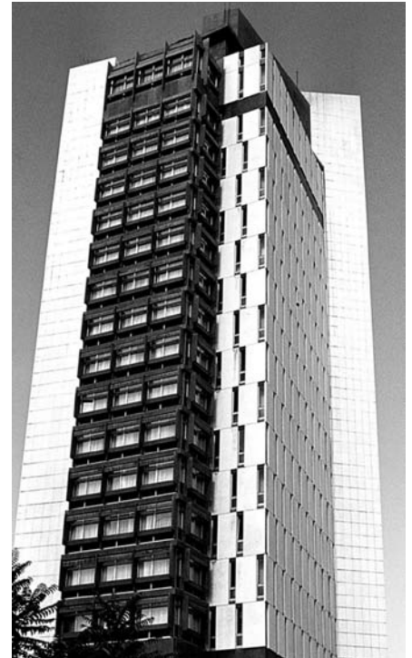
Ankara, Grand Ankara Hotel