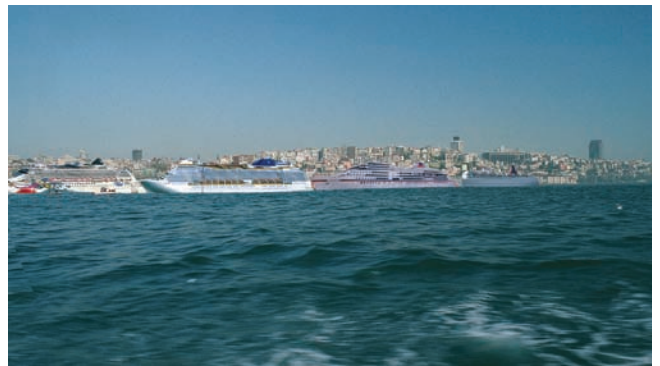
Fig. 18 Galataport (simulation). Galataport is planned for the moorage of four or five cruise ships at a quay about 1,5 km long. Five ships of the size which can already be seen in a simulation here will necessarily cause extensive demolition and new building development. The traditional city prospect seen from the Bosphorus will disappear with its historic monuments.