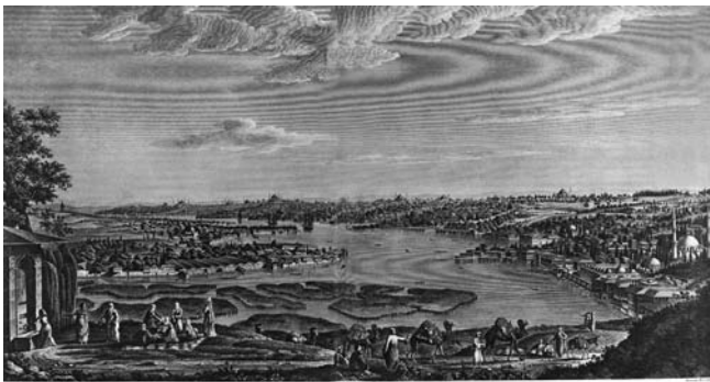
Figs. 2 and 3 Constantinople seen from Eyüp (Melling's Panorama 14, 1819) and view from Eyüp towards Istanbul World Heritage Site, 2006. This view from Eyüp towards the natural harbour is seen from an elevated viewpoint. At the horizon to the left appears the Galata Tower. Istanbul's Golden Horn and World Heritage site is almost undisturbed (if one ignores the bridge). The city's vulnerable town shape has been protected and preserved for 70 years due to effective and active measures by restricting the height of buildings to 50 m.