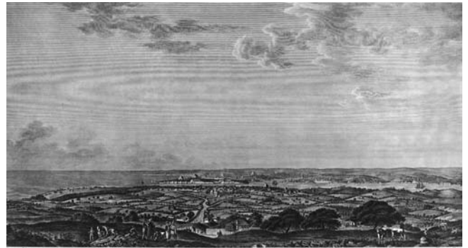
▲ Fig. 12; Fig 13 ▼