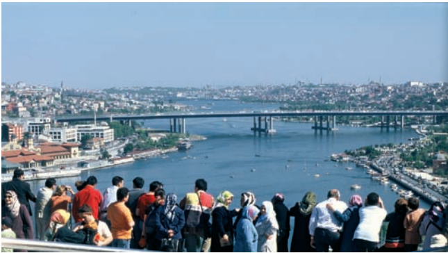
Fig. 4 Viewpoint at Eyüp, 2006. Haydarpaşa lies in this view angle at a distance of about 10 km. It seems possible that on days of high visibility this high rise project with seven skyscrapers would appear in the background between the Galata Tower and the protected WH site silhouette. The extent of the disturbance from this viewpoint at Eyüp near the famous Pierre Loti's café will depend on the future elevation, bulk and surface material of the projected tower buildings.