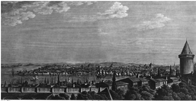
Fig. 1 Part of Constantinople with point of Serail, seen from Pera (Melling's Panorama 24, 1819). This well known panorama represents the Peninsula with the cape of Topkapı Palace and the town silhouette crowned with mosques, domes and minarets, as well as the Golden Horn and the Princess Islands.

This research on the historic urban metropolitan landscape of Istanbul is based on an extensive topographic folio volume by Antoine-Ignace Melling, which contains panoramas and topographical maps with detailed locations and descriptions of each presentation.