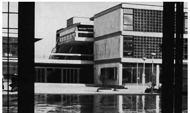
Istanbul, Drapers' Bazaar

Some buildings that have architectural significance, such as the Atatürk Cultural Centre facing Taksim Square, are under threat of being demolished. Earthquake damages and insufficient technical equipment are the main excuses for the demolition of buildings.