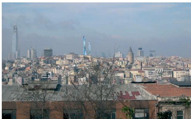
Fig. 22 Dubai Towers and Bosphorus Tower seen from Süleymaniye Terrace (simulation). The Dubai Towers and Bosphorus Tower will appear in the view angle out of the WH Site from the terrace of Süleymaniye Mosque (which is about 50 m high and 10 km away) in the background of Galata, Beyoglu, Sisli in a truly colossal dimension. They might extremely rise above the height of the Galata Tower and the context of several high-rising modern buildings. The Dubai Towers und Bosphorus Tower as viewed from the WH Site will definitely degrade and compromise the Byzantine Galata Tower of the Genuese port (the hill has an elevation of 45 m, the gallery of the tower of 44.5 m).