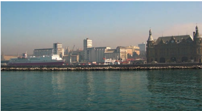
Figs. 5 and 6 Haydarpaşa seen from Marmara Sea, 2006, and Haydarpaşa Towers (simulation). It is this shore area between the Selimiye Baracks and the Bagdad Railway Station which is supposed to become a private development project Haydarpaşa with seven high-rise towers of at least 300 m height and several less high but densely packed new buildings. This Simulation of the Haydarpaşa Towers is an alternative attempt to the one of the Architectural Chamber, which presents the complete building project including seven uniform towers. In order to demonstrate how drastically these new colossal towers might influence the historic urban silhouette, different existing skyscrapers were chosen and have been made unidentifiable for this purpose.