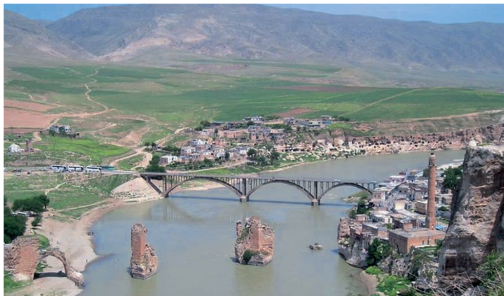
View of Hasankeyf

There are also technical problems: the rubble construction does not lend itself easily to being dismantled. Therefore monuments having rubble masonry (like the Koç and Sultan Süleyman mosques) and most of the other smaller structures, can not be transferred successfully. The relieving system in the vaulting of Sultan Süleyman mosque is very interesting. Yet, if this structure is forced to be transferred, most of the historic substance will be lost during the dismantling. Almost ninety-five percent of the masonry will have to be renewed after the operation. This means that authenticity of the cultural heritage will be lost. Authenticity is an important element of preservation. The site,