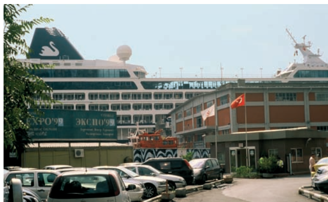
Fig. 20 Cruise ship at Tophane Pier seen from Cad Necatibey, 2006. These huge cruise ships up to 60 m high will block the traditional views from the city, that is to say the characteristic prospects on Bosphorus, Marmara Sea, Üsküdar and Haydarpasa in perpetuity.

Fig. 21 Cruise ship seen from Cihangir Slope near the Mosque, 2006. Already now some brutal barriers blocking the view from public streets and elevated places of Cihangir, as for instance right near the Cihangir Mosque and its garden can be noticed. Considering the expected mass tourism – up to 15 000 daytourists could arrive here more or less at the same time – this would cause a tremendous pressure on the city neighbourhood, especially with regard to public space and places. This dense, various and ambiguous urban structure with narrow stairs, crooked and steep streets are substantial remainders of the old and famous Galata harbour and Pera quarter.