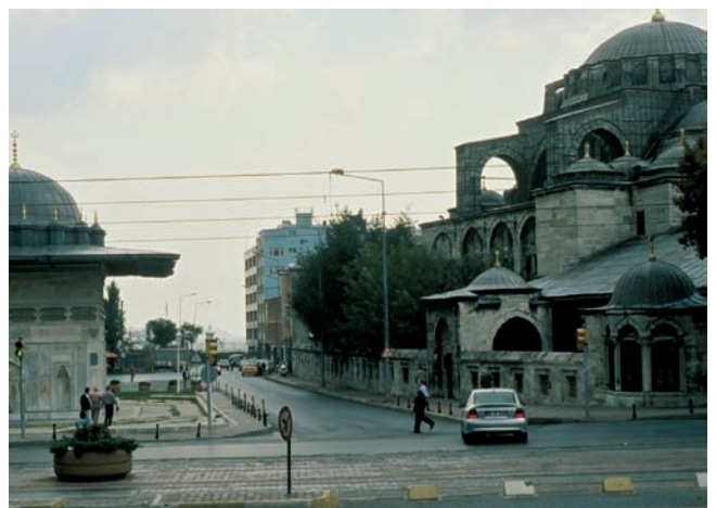
Fig. 19 Tophane Fountain and Kılıç Ali Paşa Mosque, 2006. The projected Galataport would even enlarge the barrier between the restored fountain and the Sinan Mosque and cut off the main remaining view on Bosphorus and Marmara Sea for ever. This would also mean a further loss of public space in favour of a private project.