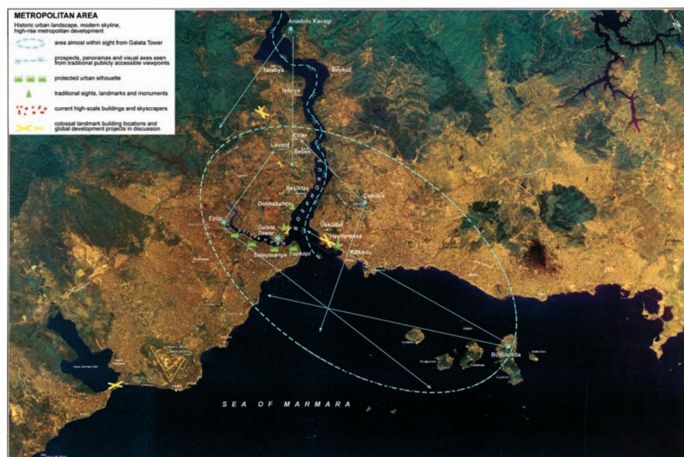
Istanbul UNESCO World Heritage Site Visual impact assessment study (preventive plan project)