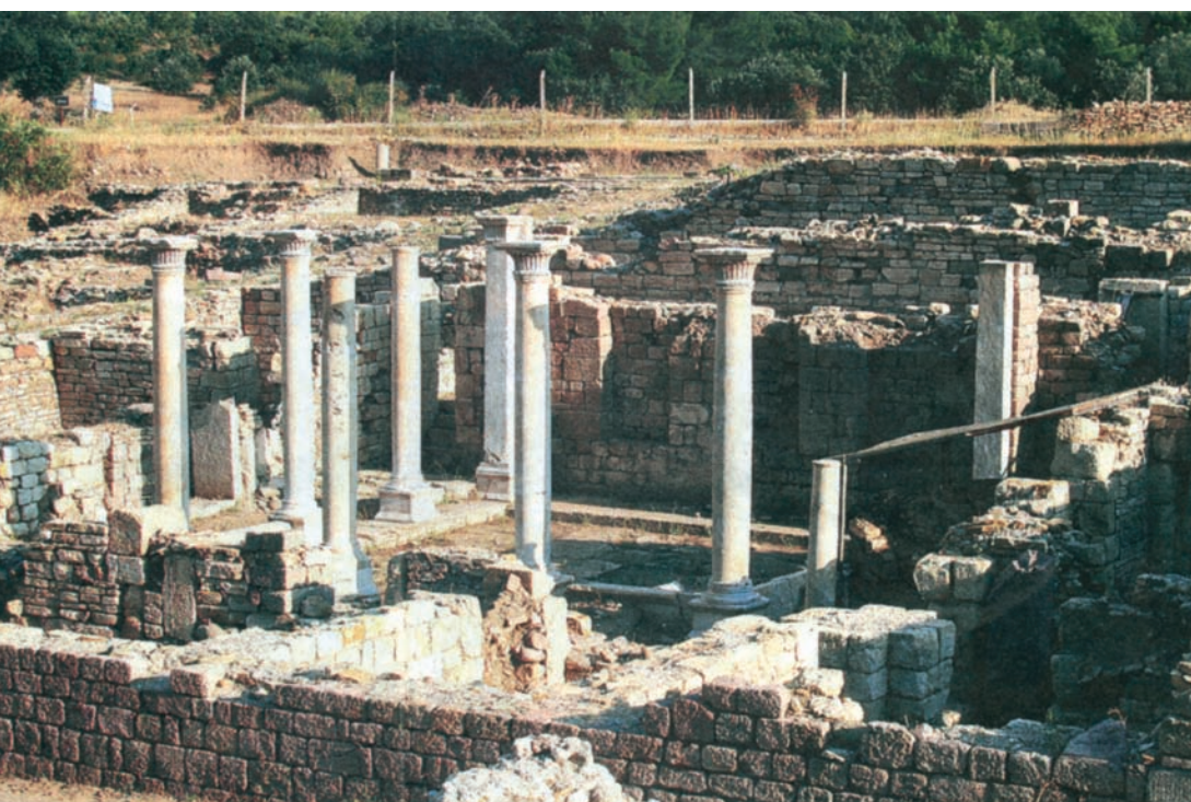
Detail of the archaeological site of Allianoi

In the light of the above, we jointly urge the Turkish Government