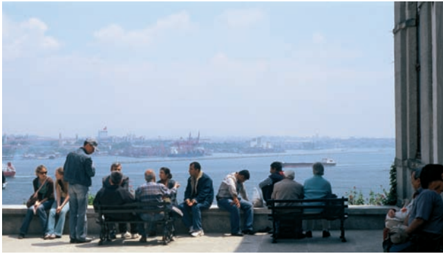
Figs. 7 and 8 Haydarpaşa seen from Topkapı Terrace, 2006 and Haydarpaşa Towers (simulation). A very much appreciated viewpoint is the one very near the Topkapı Terrace. The simulation presents that it would become a gigantic Manhattan-like sight.