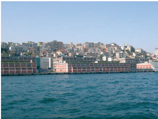
Fig. 16 Tophane Pier with Cihangir Mosque, 2006. Today there are stores and administrative buildings situated right at the shore and covering a large fenced area. There are still freighters being loaded, which however can only be observed from the terrace of Istanbul Modern Museum, located in one of the reused stores. The public Tophane place of today is very much reduced and dominated by traffic. Behind this the densely built up hill of Pera with the Cihangir Mosque right up.