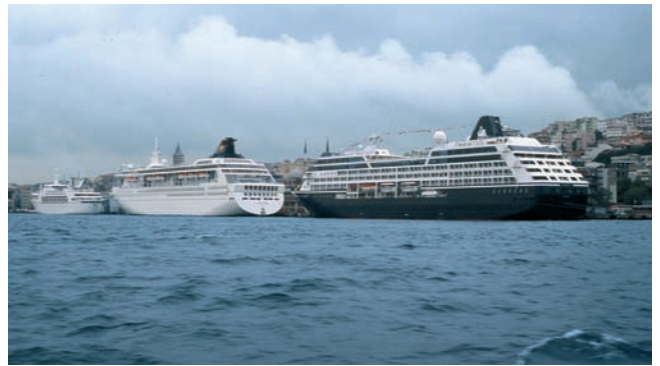
Fig. 17 Cruise ships at Galata Port hiding the prospect of Tophane. Tophane shore is frequented by huge cruise ships which, if several ships are mooring at the same time, form a high and long barrier. The famous Pera prospect seen from boat excursions on the Bosphorus is hidden very often behind gigantic tourist steamers. This applies accordingly to the characteristic domes of the gun-foundry and mosques. The cruise ships present a new scale in the urban landscape which implies a break with the traditional cultural landscape of Byzantium, Constantinople, Istanbul.