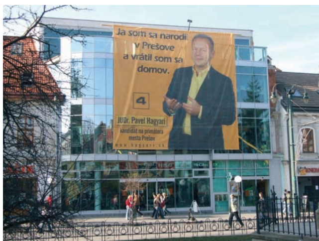
Prešov, house in Hlavna Street 107B and 109

There are other equally negative examples of illegal building and/or restoration activities. In our country there is no institution that conducts building inspections. Sometimes illegal houses can also be legalised subsequently. An owner can obtain a building approval belatedly either by “an amendment to the project documentation before the end of building works” or by the “subsequent legalisation of a building”. Fines today are rather low so that they can be allowed for in the project budget. Unfortunately, the demolition of such buildings after they have been completed is almost impossible.