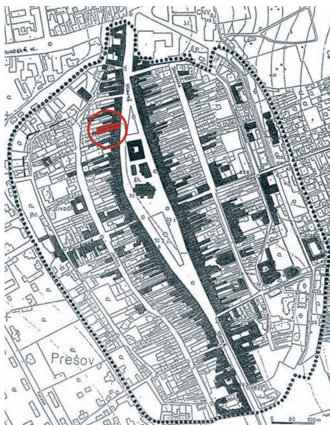
Map of Prešov