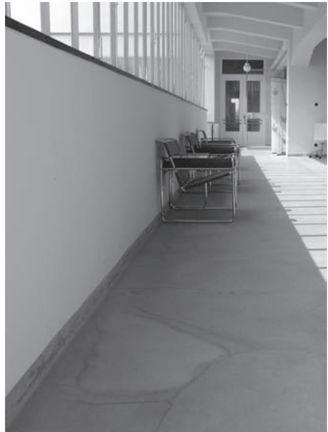
Stone/wood composite floor after repair, bridge, 2nd floor, 2006

Like many other Modernist buildings, the Bauhaus Building has aged badly, and not only because of the nature of its construction. It also embodies a form of architecture that declined to be restricted to the formal expression of modern society's endeavours, preferring instead to con-