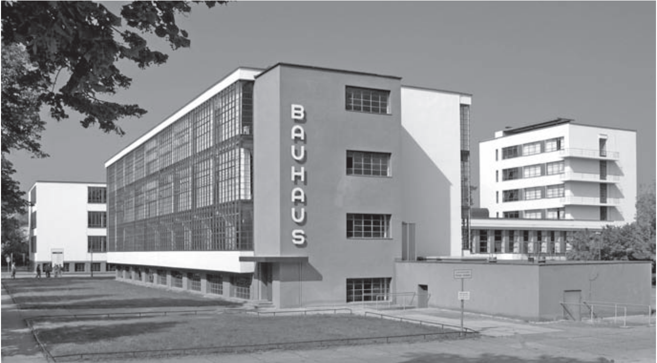
Bauhaus Building, south-west view, 2006

Every generation faces the issue of choosing which of the preceding generations' material goods and spiritual values, that is which parts of their cultural heritage it keeps and conserves.