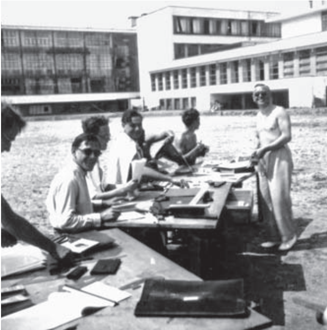
Architecture class in front of the Bauhaus, 1931