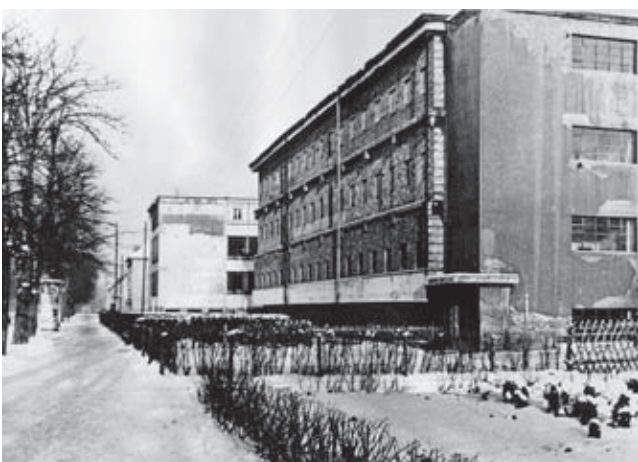
Bauhaus Building, south-west view, 1956

senseless destruction of cities can only be understood as a manifest, violent resistance against the highest values of civilisation". He cites the example of Dubrovnik "The strike on Dubrovnik – which I dread to mention, but must – was fully intended as an attack on an exceptional, almost mythical, beauty. The instigators remind us of a maniac who throws acid in a woman's face while promising her a new, more beautiful countenance!" 1