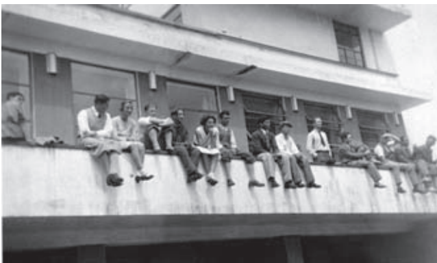
Bauhaus members on the refectory terrace, 1931