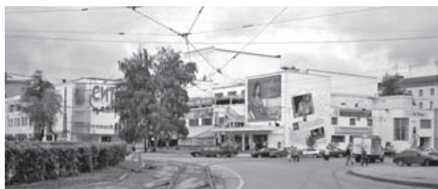
The present condition of the Builders' Club

programmed use of monuments belonging to the given period;