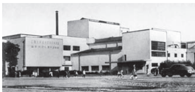
Club Stroiteley, 1930s