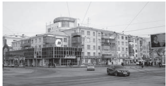
The present condition of 4 Dom Gorsovet