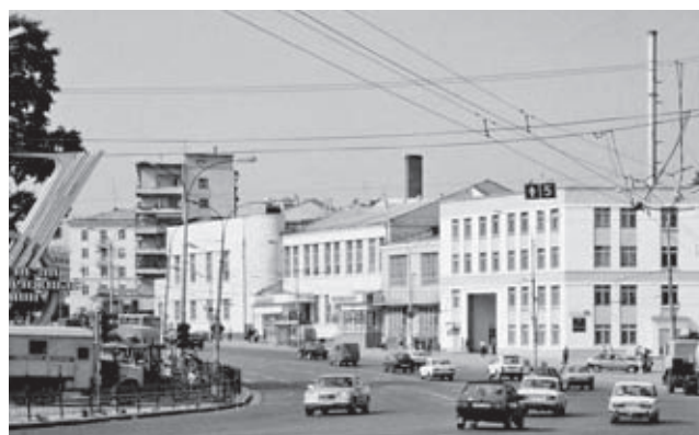
The present condition of Fabrika-Kukhnia