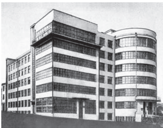
Dom Justitsii completing Malysheva street, 1930s

The avant-garde period was short but significant for the history of Ekaterinburg. Developments that took place there in the 1920s and 1930s both changed the appearance of the city and considerably influenced its present general layout.