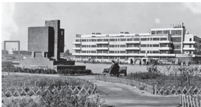
The main square of sotsgorod Uralmash in the 1930s. On the left a water tower completes the Cultury Boulevard