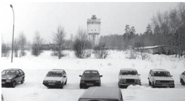
The present condition of the water tower