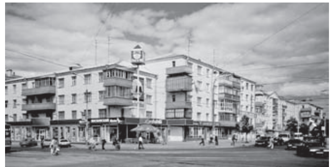
The changes of 4 Dom Gorsovet in the late 1990s