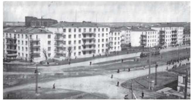
The apartment complex 4 Dom Gorsovet, 1930s

Although "Sverdlovsk modernism" is in a critical state, until the present time little has been done to investigate and systematize the experience of the avant-garde period in Sverdlovsk and the Urals; there has been no active and organized work on conservation and restoration of its monuments. When outlining the path for conservation and restoration of the modernist heritage of Ekaterinburg, one should specify a number of high priority tasks. There is no need to mention how much the majority of those monuments need repairing, as the problem is typical for this style on the whole. Ekaterinburg, in particular, has to solve the following problems: