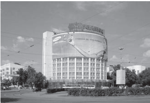
The present condition of Gorodok Chekistov

asymmetrical arrangement of elements. The complex was well thought-out: on the one hand, it proceeded from the types of activities of its residents; on the other hand, it provided the latest achievements in housing construction and socialist life standards. The impregnable walls formed by the apartment blocks of the Gorodok-fortress hid behind them a system of cultural and community facilities conveniently arranged in an internal park, side by side with recreation and sports areas and playgrounds. Asymmetry and complex architectural rhythms of apartment blocks were compensated by common elements of façade design: smooth walls with window openings alternate with vertical lines of bay windows and glazed bands of staircases. End façades are rounded-off with balconies.