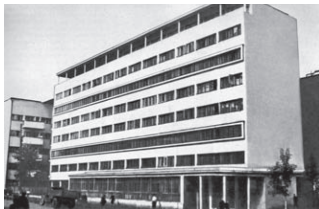
The apartment complex Uraloblsovnaarkhoz, 1930s

The fact that Gorodok Chekistov (Security Officers' Block) played a prominent role in the ensemble of the new city centre on Parizhskey Kommuny (Paris Commune) Square demonstrated the growing influence of NKVD-OGPU (People's Commissariat for Home Affairs – Unified State Political Department), the complex client. The project, designed by architects I. Antonov, V. Sokolov and A. Tumbasov (art design), was carried out from 1929 to 1936. The Gorodok Chekistov was planned as a single ensemble. Although the composition contains the same elements as other similar projects of the time, its compositional entity is unique. An image of an impregnable fortress was created at the expense of a reserved and balanced character, combined with an