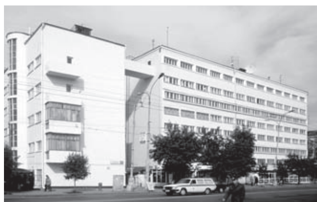
The present condition of Uraloblsovnaarkhoz