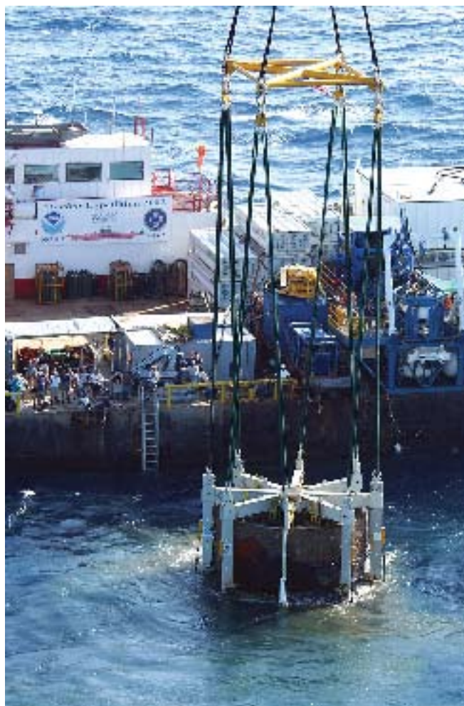
Figure 4: The Monitor 's gun turret emerging from the sea, 5 August 2002

sanctuary. Navy divers recovered the Monitor 's propeller, engine, and its famous gun turret, which still contained the guns, carriages and hundreds of other artifacts. Also discovered inside the turret were the remains of two of Monitor 's crew. All recovered artifacts and hull components from the Monitor are located at The Mariners' Museum, Newport News, Virginia, where they are undergoing conservation treatment that, for the larger objects, may require a decade or more to complete. The plans for conservation and curation are consistent with the US Federal Archaeological Program as well as the Rules annexed to the UNESCO UCH Convention.