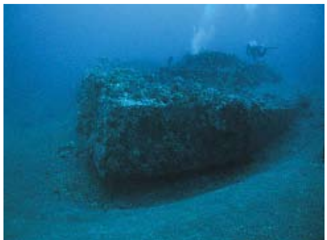
Figure 3: NOAA researchers documenting the bow of the USS Monitor

During 1998 to 2002, NOAA and the US Navy carried out the six-phase plan during a series of large-scale missions to the