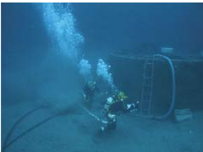
Figure 2: US Navy divers videotaping the Monitor 's gun turret in preparation for recovery

NOAA continued gathering data at the site but also began consulting with marine engineers and salvage experts to identify strategies for responding to the developing crisis at the sanctuary. There was a growing realization that even under an in situ preservation policy, it was time to consider alternative plans for more rigorous research and recovery at the wreck site.