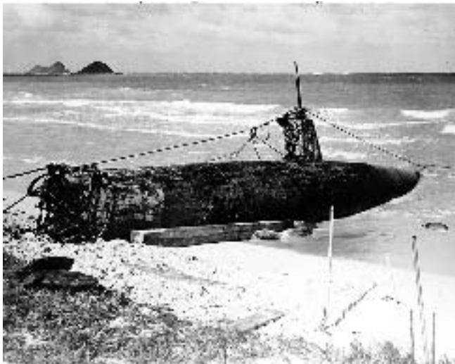
Figure 3: Sakamaki's midget sub HA-19 ashore on Oahu, December 8th, 1941

of State and the Government of Japan. On February 12th, 2004, the Government of Japan and the US exchanged diplomatic notes agreeing that: the US owned and controlled the midget sub; the site should be respected as a war grave as well as an historic resource; it should be protected and managed in accordance with international law, US historic preservation laws, and the US Policy for the protection of Sunken Warships (January 19th, 2001); and that under the maritime law of salvage the US, as the owner, is exercising its right to preserve its property where it has been discovered, and provides notice that it should not be salvaged or disturbed in any manner without the express authorization of the owner.