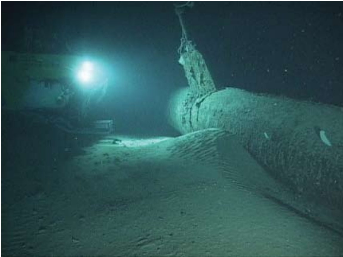
Figure 1: Portside of midget sub and HURL research submersible Pisces V