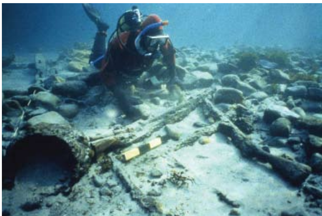
Figure 2: The wreck of the Elizabeth and Mary, at Baie-Trinité in Québec, at the moment of its discovery in January 1995

Third, although the primary objective was in situ preservation, it was important to gather information that would be useful for future excavations. Should it prove impossible to stabilize the site, emergency excavation would be initiated. Any information to help plan and optimize the archaeological