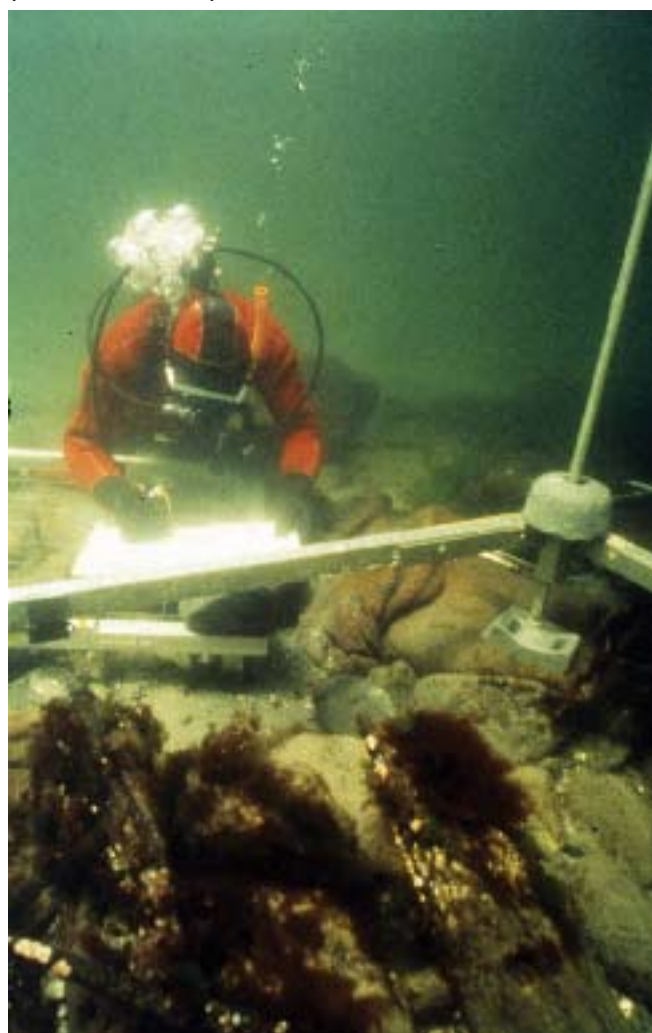
Figure 1: Diver recording the plan of in situ remains of Elizabeth and Mary during the process of site evaluation in 1995 (Marc-André Bernier)

This can be a heavy responsibility for underwater heritage managers if they do not have guidelines to provide clear direction and ensure consistency and continuity of action. These guidelines can be policies, directives, or even legislation. No matter what form they take, they must be clear enough so that the action to be taken is not left to drift because of individual interpretation, and flexible enough so that the manager is not put in an administrative straightjacket that limits effectiveness.