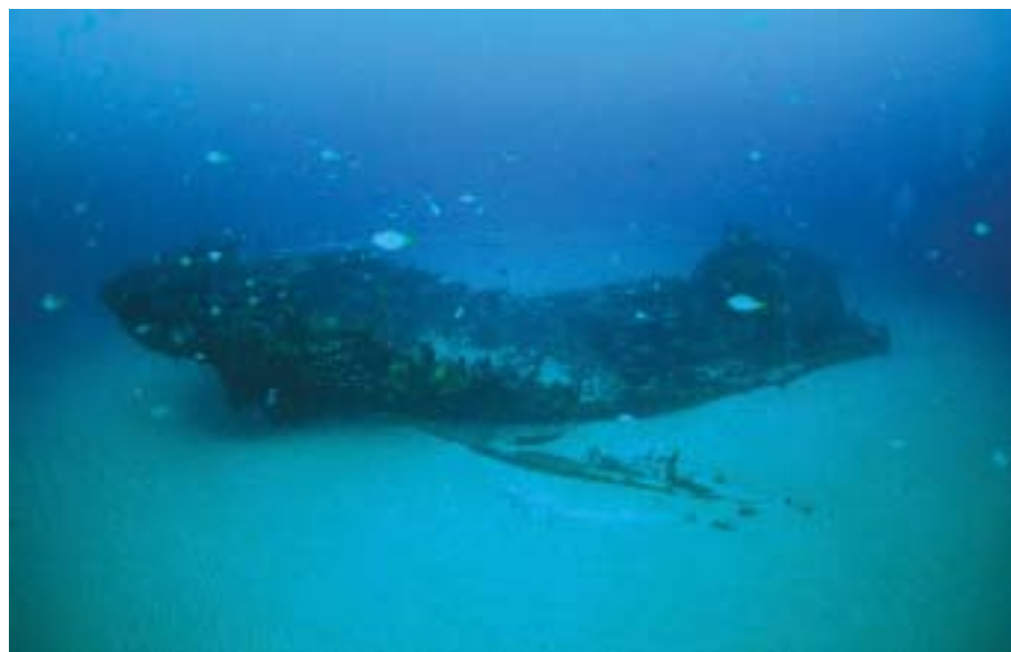
Figure 1: Lady Darling wreck – from stern to boiler at midships (D. Nutley)

Other identifiable features are expected to survive beneath present sand levels, particularly forward of the boiler, the