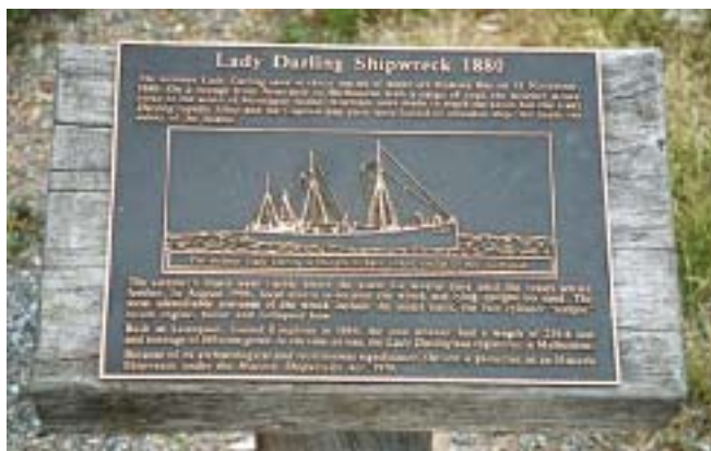
Figure 3: The plaque - funded by the Eurobodella Shire Council (D. Nutley)

shipwreck in Australia as accessible and as frequently visited as the Lady Darling that is as intact and as attractive as the day it was found.