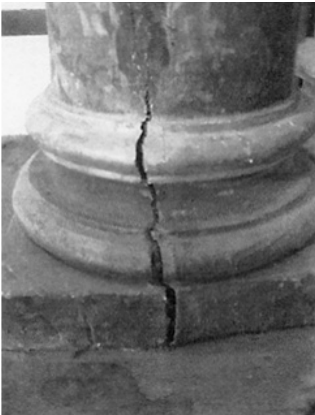
Grietas en estructura por cambios de humedad