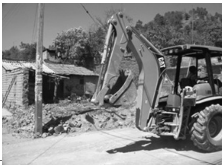
Destruction of adobe buildings in Hueyapan (Morelos)