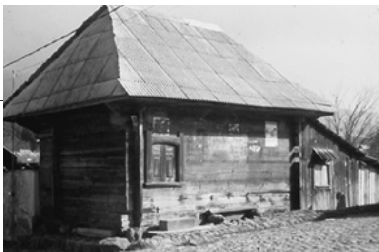
Wooden construction in Angahuan (Michoacan)

Similar situations are occurring throughout the country. The small town of Hueyapan, on the foothills of the Popocatepetl Volcano, is