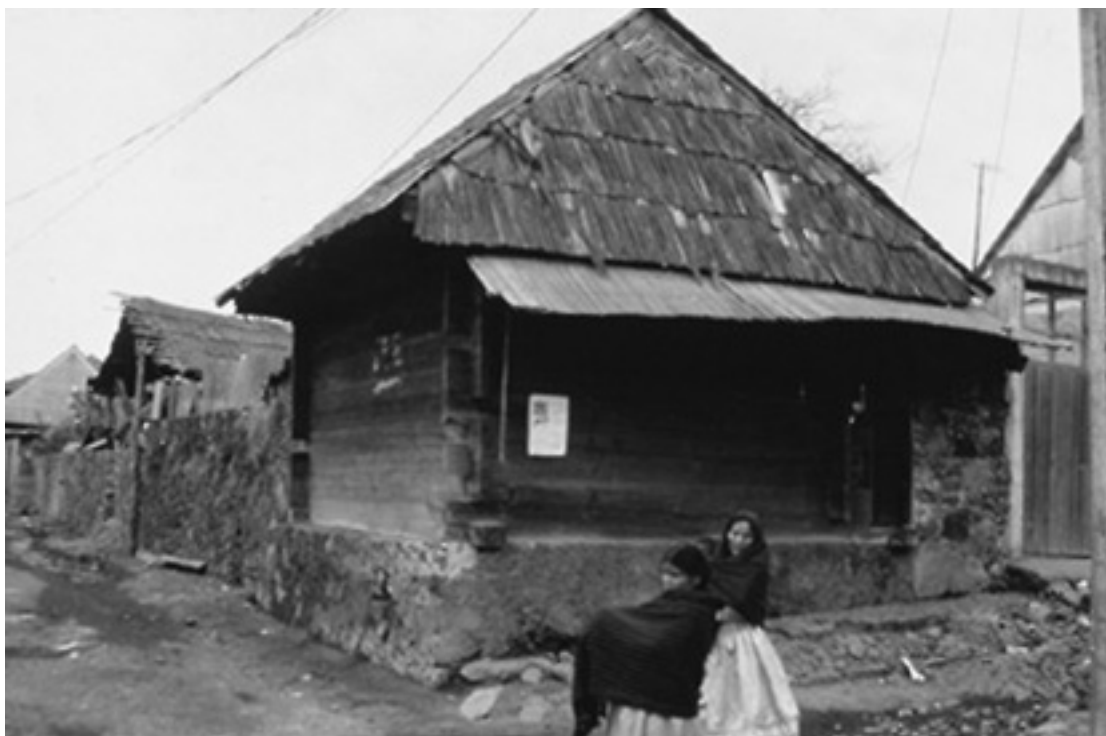
Houses in Angahuan (Michoacan)