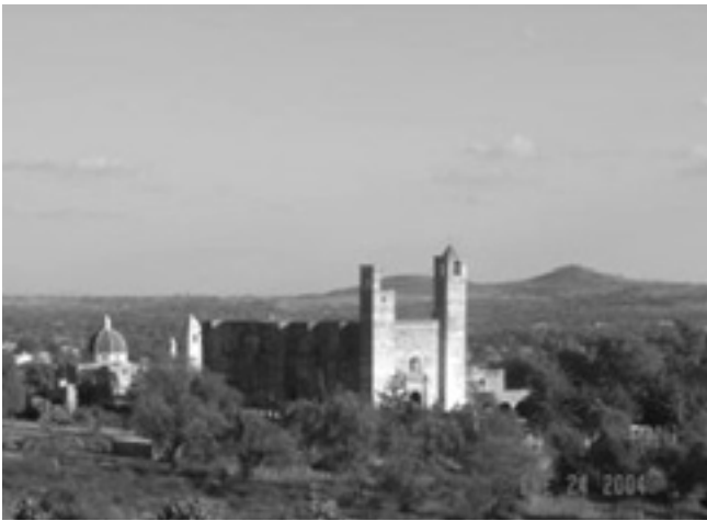
General view and ground-plan of San Juan Cuauhtinchan ▲ ▶