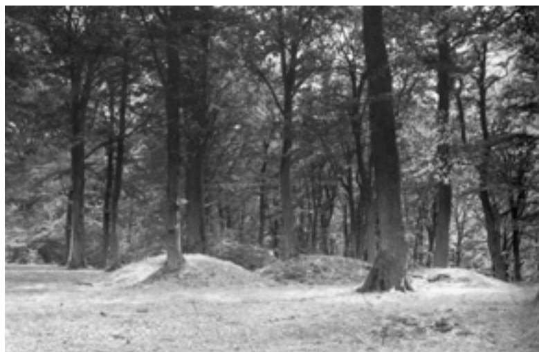
Runowo – early medieval barrows at Runowo in northern Poland – example of archaeological and nature protection area (landscape park)