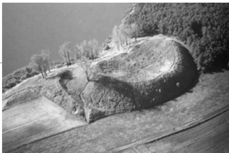
Napole – early medieval stronghold at Napole in northern Poland – the site is in good condition and not ploughed, but the neighbouring area is destroyed – so the site is not part of a historical landscape, but an isolated monument

Systematic ploughing destroys most archaeological sites (for example, in Poland some 400,000 sites were recorded on agricultural lands, most of them regularly ploughed), but it is not a readi-