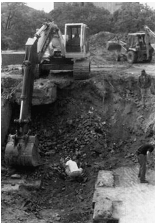
Excavation at Independence Park Visitors Centre, Philadelphia