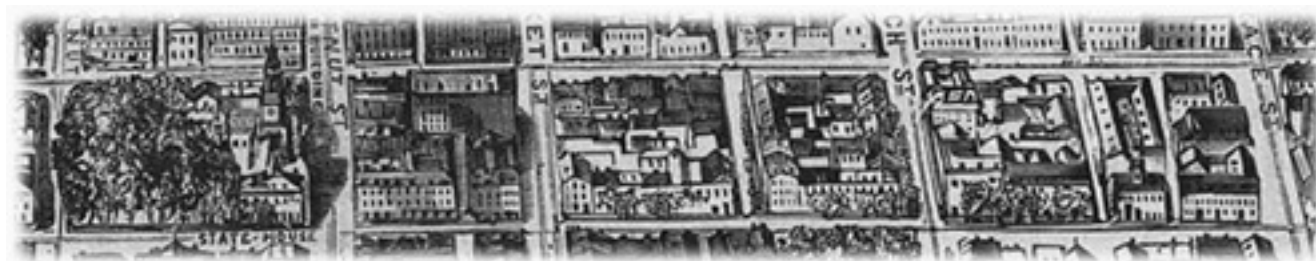
Detail of 1872 panorama of Philadelphia, Independence Hall left

After sponsoring five million dollars of archaeological research – an almost unprecedented figure in American archaeology – the president of the National Constitution Centre said, as reported on 30 April 2002 by the Philadelphia Inquirer , „I don't think we could justify taking more funds away from the building project. This is not a museum about the 18th-century life on the ... block". In the fall [northern autumn] of 2003, the National Park Service acknowledged that they were responsible for the completion of archaeological work, a proclamation that was worrisome to many most concerned with the research. On 14 November 2003, the Philadelphia Inquirer quoted Anthony Ranere, professor of archaeology and anthropology at Temple University, as saying: "It's hard to evaluate what they'll be able to do. It's unbelievable, and it's worrisome". The National Park Service remains vague about how they will complete cataloguing and preservation of artefacts, along with analysis of the myriad finds, and finally sponsoring an academic analysis of what they mean to American histo-