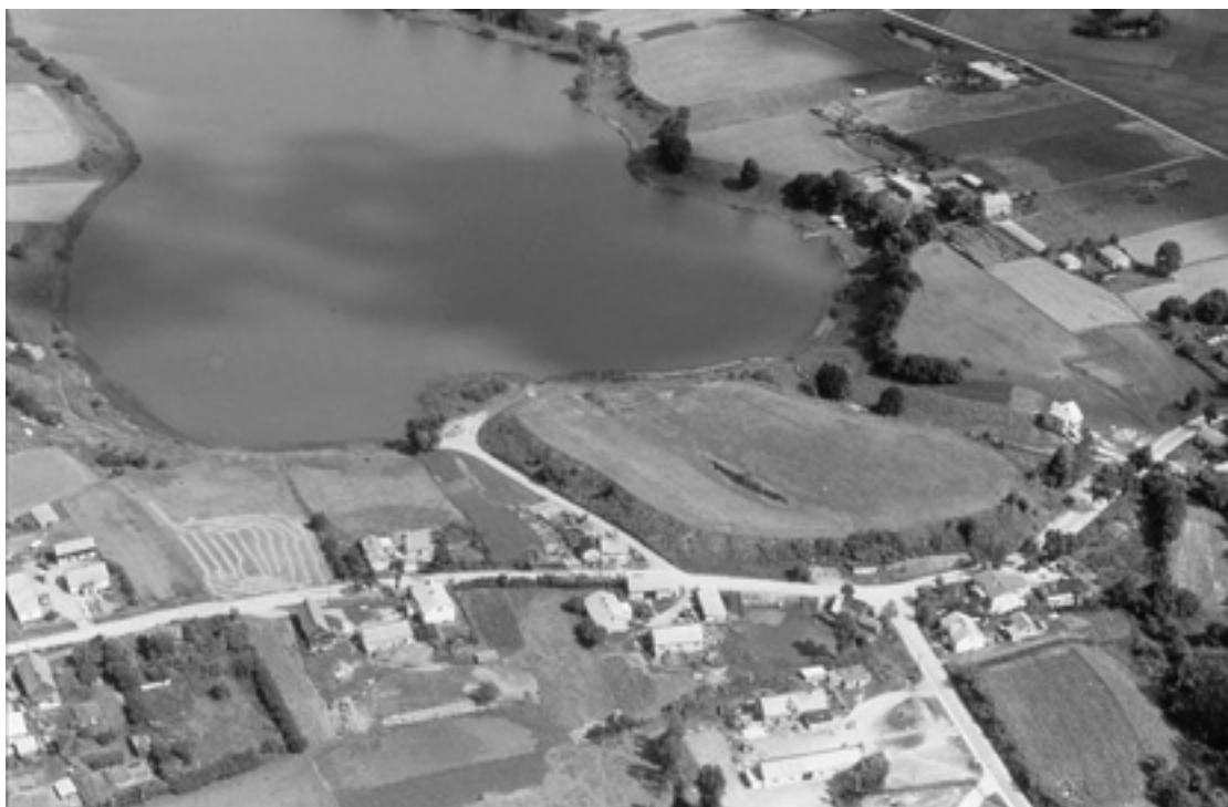
Zale – early medieval stronghold at Zale in northern Poland, systematically destroyed by ploughing

Whilst these remarks may merely seem to be those of a ‘Cinderella’ in heritage conservation, at a time when ICOMOS sees landscape and setting as worthy of the next General Assembly’s scientific focus, there is an opportunity to approach all heritage places in a more integrated and holistic way.