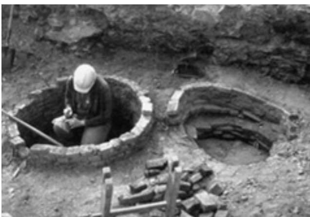
Shallow features can be destroyed by modern construction, Independence Park Visitors Centre, Philadelphia