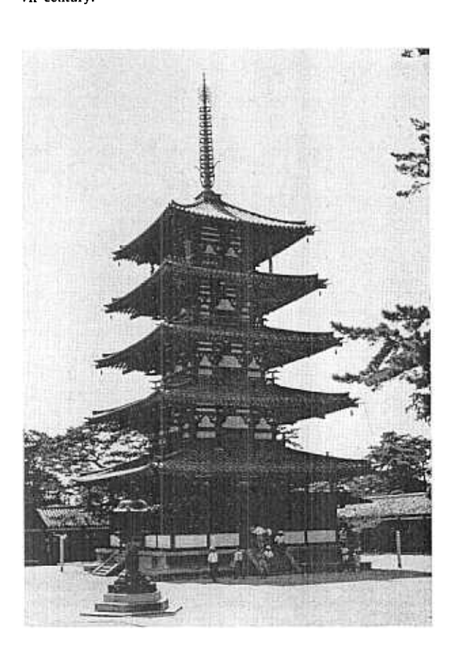
Fig. 1. — Five storied Pagoda, Horyuji Buddhist Temple,

due to the long standing sectionalism of each discipline. It would be much more difficult if there is no center of teaching and training for historic preservation. For this reason also, we need to have a university or an institution to set up the graduate level courses for the architects and technicians for historic preservation where not only a sufficient number of technicians can be trained but also to ensure that the level of techniques is to be kept high enough.