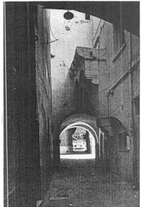
7 - One of the many covered passages leading to the Hohenstaufen castle.