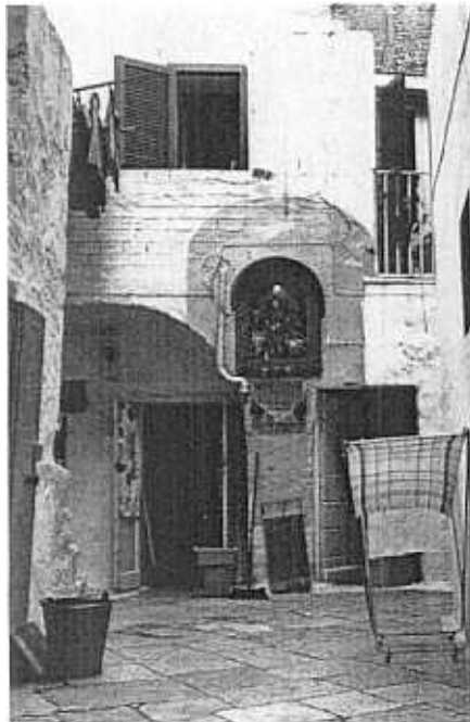
6 - Semi-private open spaces like this courtyard often have interesting limestone slab pavements, graceful staircases, or niches with naïve images.

For the moment it is not only impossible to plan an enjoyable use for such spaces; it is even difficult to preserve their mere physical structure.