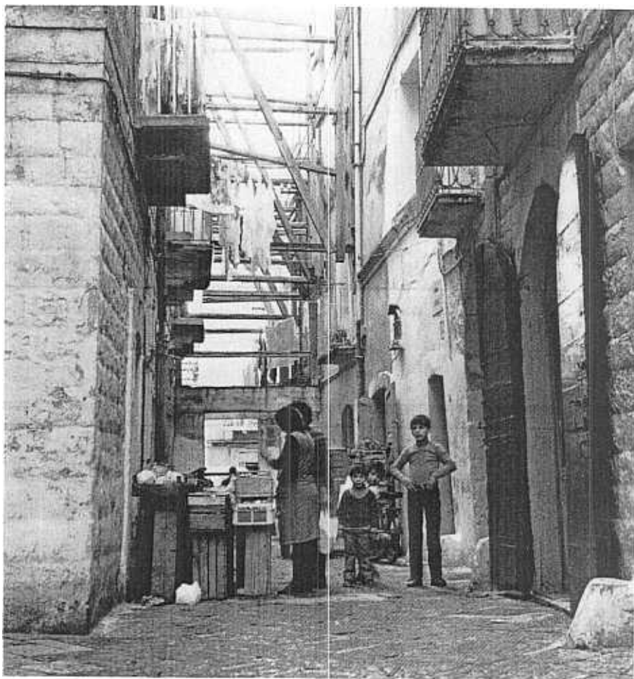
9. - Decay of the buildings in the old town. On an average of ten buildings on the way to collapse only one has so far been restored.

Mais leur qualité médiocre contribue, d'un autre côté, à marginaliser la vieille ville, en la coupant de tout échange avec le reste de la cité. Bari est en train de perdre une partie de son noyau le plus central, et cette perte affecte d'une certaine façon chaque habitant.