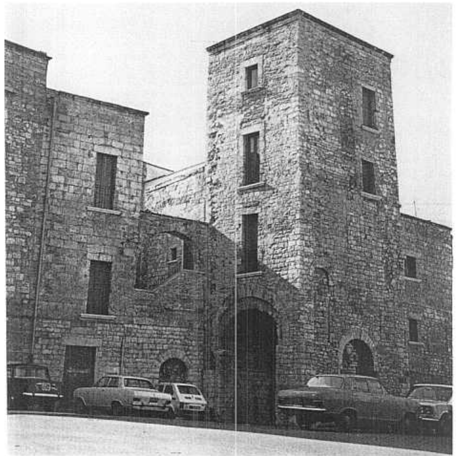
3. Block 49 after restoration.

Work on this pilot group of buildings was planned with due allowance for the subsequent further work which would be essential to suit them to their new uses once restored, not excluding the possibility that, if considered appropriate, they might be used as living accommodation and so require the improvements corresponding to present-day needs.