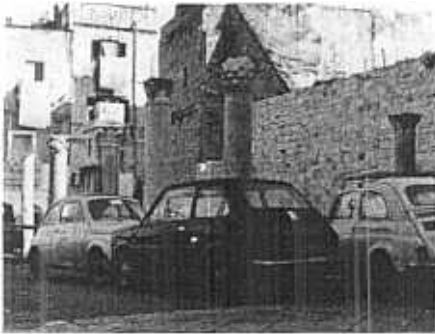
4 - In spite of the restrictions the old town is invaded by cars.