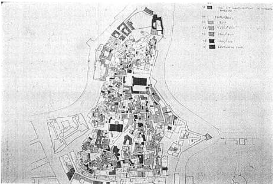
Map of the old centre showing the various stages by which it was built (Calordias).

In both cases the original masonry of the buildings has been freed of obstruction through demolition of all the superimpositions and subdivisions of later periods which had altered their character, such as contiguous masonry structures, walls so built as to create mutual incompatibilities, buttresses, etc., and, on the inside, extra floors, partitions, small wooden staircases, garrets, etc.