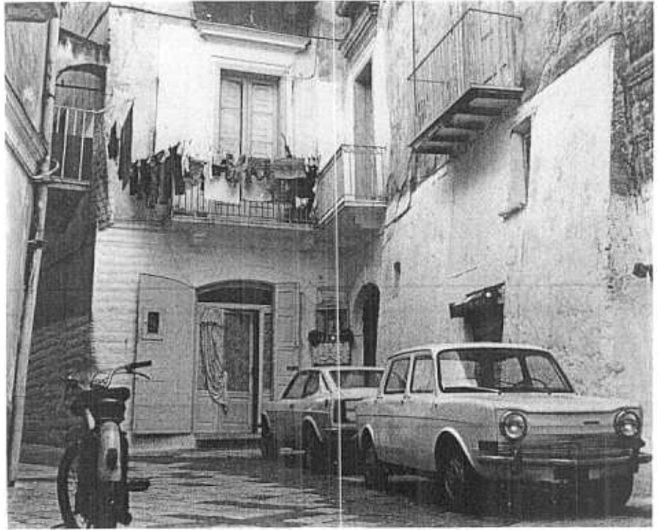
5 - Although the old town has been declared a pedestrian precinct, all residents want to park their cars immediately in front of their own doors.

yard was the real place for community life, the place for intercourse and relaxation — a spatial application of the theoretical concept of the "unity of the neighbourhood". Today the courtyards are still there, but the neighbourhood spirit has disappeared.