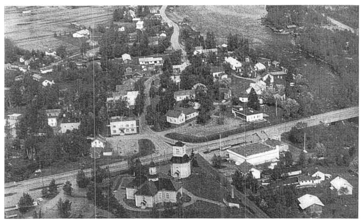
4. Raumankari village in Himanka

ved in Hauho, where special building and cultural provisions were approved at the regional planning stage. When it come to detailed planning an accurate inventory was made and a classification was introduced. For certain special areas new building permits need to be approved by the Central Board of National Antiquities and Historical Monuments; this means that the planners must contact our Board at the appropriate stage and that consequently new architecture is properly fitted into the traditional environment. It is also a stimulant to owners to repair their old houses rather than build new ones.