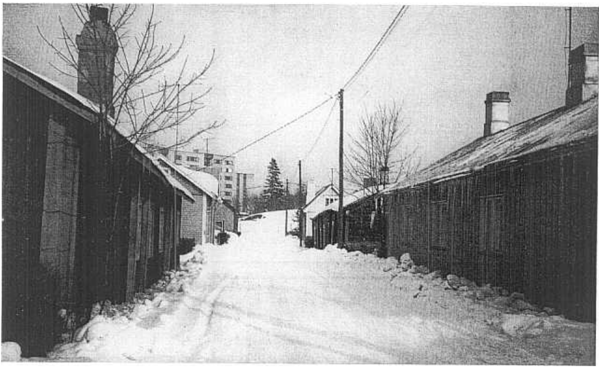
1. Forssa Kalliomäki