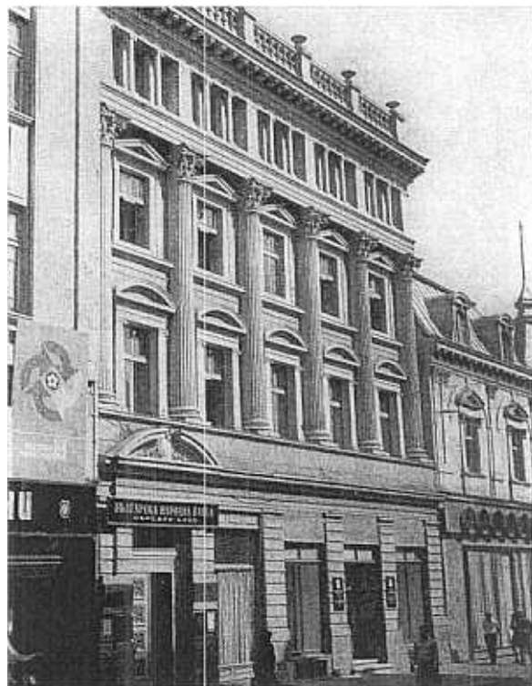
3. Plovdiv. The commercial street, a bank.

Old buildings are to be found at the foot of the Three Hills and in those parts of the city, where incipient capitalism flourished after liberation from the five centuries of Ottoman rule. Some of them, imitations of European styles from the end of the 19th century are impressive structures full of romanticism. Examples are the commercial street and a few densely built streets in the central part of the city. Many of the buildings here have been adapted to the needs of trade and cultural life, for children's institutions, dwellings, administrative needs, health services and education. Many of them will continue in future to serve the same purposes.