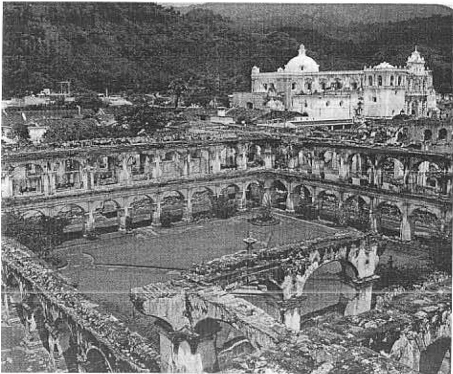
The Monastery of Santa Clara, Antigua Guatemala.