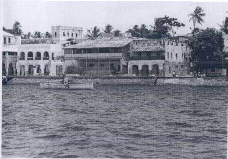
From the harbour, Lamu town presents a panorama of nineteenth-century arcades. Their rhythm is the colonial presence of German and English merchants. Behind this waterfront and the crenellated wall lies the older Islamic townscape with its shuttered high-walled houses, narrow alleys, and black veiled

1 J. de V., Lamu (Guide) , J. de V. Allen, p. 48, Lamu, Kenya.