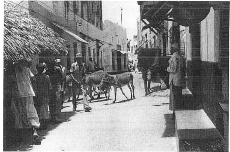
FIG. 3. The main street, running parallel to the waterfront, remains a pedestrian way. The narrow track captures the wind and provides some shelter from the tropical sun.

Behind the verandas and porticos of a largely nineteenth-century waterfront, there resides an older Islamic town of coral houses, whose massed regularity of architectural form and anonymity of exterior wall is cut by narrow alleys no wider than an overladen donkey and punctured by carved doorways that hide an interior architectural richness of carved plaster work ( Fig. 1 ). Some twenty-nine mosques help identify the sections of this town, whose principal monument is a nineteenth-century Omani fortress frowning down on an ugly concrete market which imposes itself on one edge of the only square.