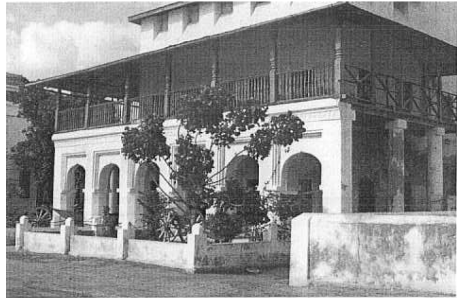
FIG. 4. Lamu, the museum on the waterfront.

A peripheral zone surrounding the conservation area would supposedly accommodate certain related uses such as hotels and public purpose developments. A green belt which recognizes the predominant land use of plantations or 'shambas' which characterize the land use west of town,