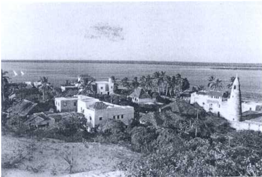
FIG. 5. Seen from the sand dunes which are gradually encroaching, the sleepy village of Shela, twenty minutes walk from Lamu town, faces another threat to its seventeenth and eighteenth-century architecture. The new houses of the affluent crowd the ruins and the proposed conservation plan accepts the pattern of economic development here. Will a hotel tower some day dominate the minaret of the Friday mosque on the right?

Unfortunately, the old village of Shela, nestled beside the sand dunes on a point south of Lamu, is placed in the 'development' zone (Fig. 5). Perhaps there is already too much political pressure there as the Lamu bourgeoisie and foreign expatriates push their new villas between the ruins of mosques and houses of this important seventeenth-century town. The carved plaster 'kidaka' or niches which characterize the old interiors are exposed to the weather and the bats. Although the new development there, particularly the charming and quietly refined Peponi Hotel, has been respectful of the existing architectural tradition, the future of the area, like that of the larger town of Lamu, depends on the sensibility of individual property owners rather than governmental policy. The expense of importing building materials foreign to island construction traditions and the recent ebb in the flow of tourism because of the Iranian oil crisis, which reduced flights, remain the best preservers of an architectural tradition. An old missionary, the only other traveller this writer encountered on the dusty land route to Lamu, shook his head and said that Lamu was already lost, and had been since the days when it took