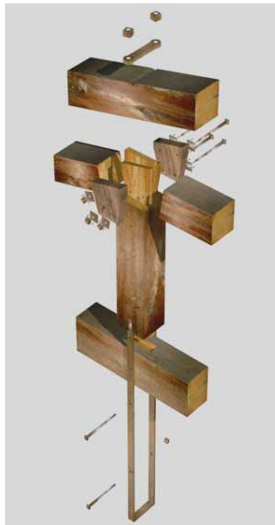
Figure 3: Exploded axonometric view of the node of the same truss. Two "voussoirs" of hard wood (oak) have been inserted between the concurring members to convey the stresses