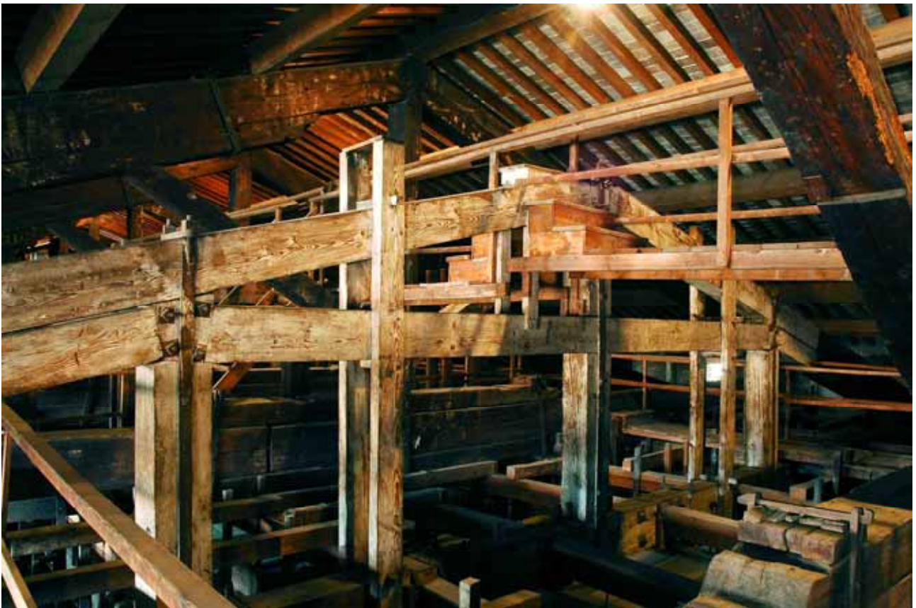
Figure 1: General view of the "soffitta" (the garret) of the Salone dei Cinquecento