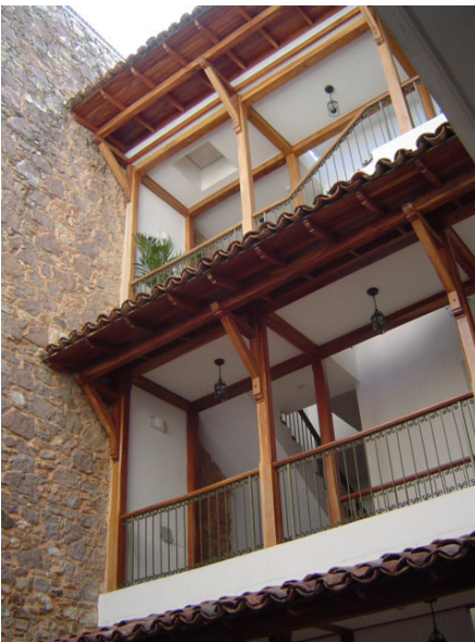
Restored back facade. 2002 rehabilitation of XIX post-colonial "Casa del Chicheme" house. Casco Antiguo (World Heritage Site) Panama. 2002