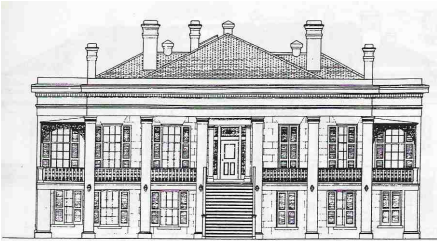
Existing Facade, 1846 Belle Alliance historic plantation. HABS/HAER program, National Park Service, Tulane University. Donaldsonville, Louisiana, USA. 1999.