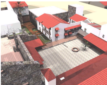
XVII Santo Domingo Convent Rehabilitation. Casco Antiguo. Render