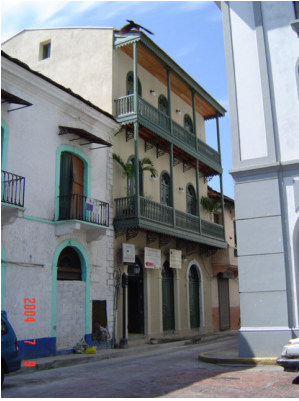
Restored Front Facade, "Rehabilitation of House Casa Remón", 5th St. Casco Antiguo. Pmá. 2004.