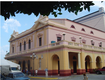
Restored front facade. 2004 rehabilitation of 1908's National Theater. Casco Antiguo (World Heritage Site) Panama. 2004.