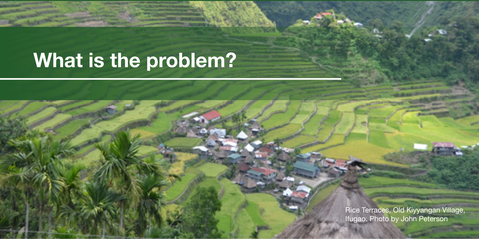
Rice Terraces, Old Kiyangan Village, Ifugao.

T he subject of climate justice and equity brings together a range of topics relating to human and cultural rights. Specifically, it refers to the unfair or unequal distribution of climate change impacts and responses . These usually affect the poor and vulnerable who are experiencing greater social and economic disadvantage and an erosion and marginalisation of their individual and collective human and cultural rights. These experiences can be further exacerbated by oppression, discrimination, racism, sexism, homophobia and xenophobia. The promotion of equity involves acknowledging how these inequalities operate in practice and working to address them. More specifically, it requires us to acknowledge that: