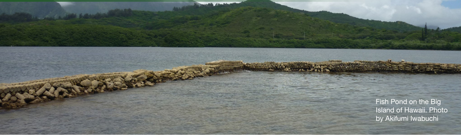
Fish Pond on the Big Island of Hawaii.

A ttention to climate justice and equity can include both individual and collective actions. These might include: