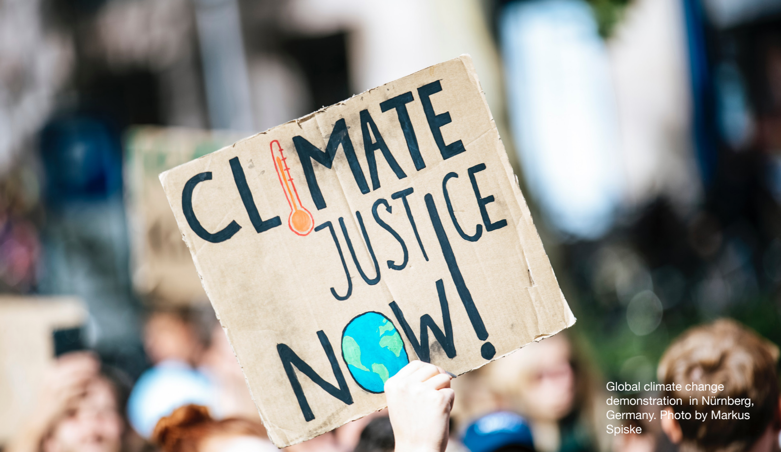
Global climate change demonstration in Nürnberg, Germany.