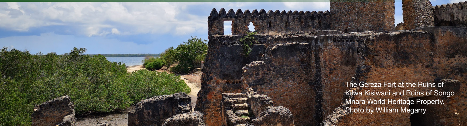
The Gereza Fort at the Ruins of Kilwa Kisiwani and Ruins of Songo Mnara World Heritage Property.

E ngagement with climate justice matters as it is about protecting and safeguarding individuals and communities' human and cultural rights. As ICOMOS members engaged in the safeguarding of heritage, we have a responsibility to ensure how we operate is both fair and equitable . We should and must demonstrate sensitivity and commitment to protecting human rights in all our activities by making links between the rights of people and a human-centred development approach aimed at the protection of the basic rights of the most vulnerable groups and the sharing of both the burdens and benefits of climate change. As part of this, we should and must actively enable communities to be in charge of defining, implementing and contributing as an equal partner to climate actions which protect their own interests, livelihoods, economies, cultural heritage, and rights.