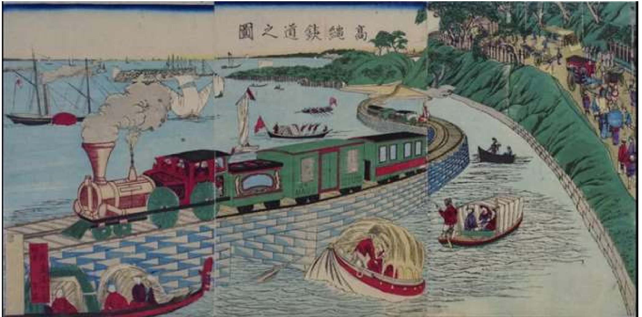
Fig. 3. Color print showing Takanawa Chikutei in Meiji Era (Stored at Minato City Local History Museum)