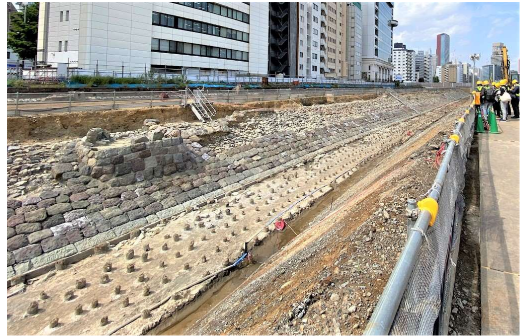
Extending embankment with the traffic-light base unearthed in Block 4 (from south), to be removed