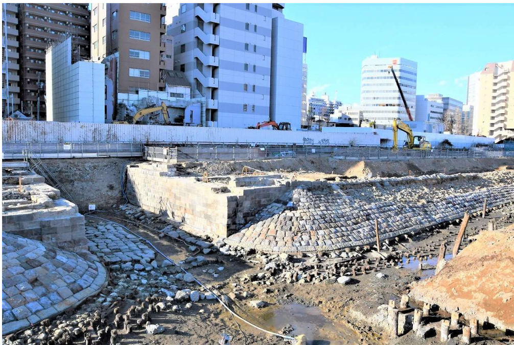
Bridge section in Block 3 (from east), to be partly preserved