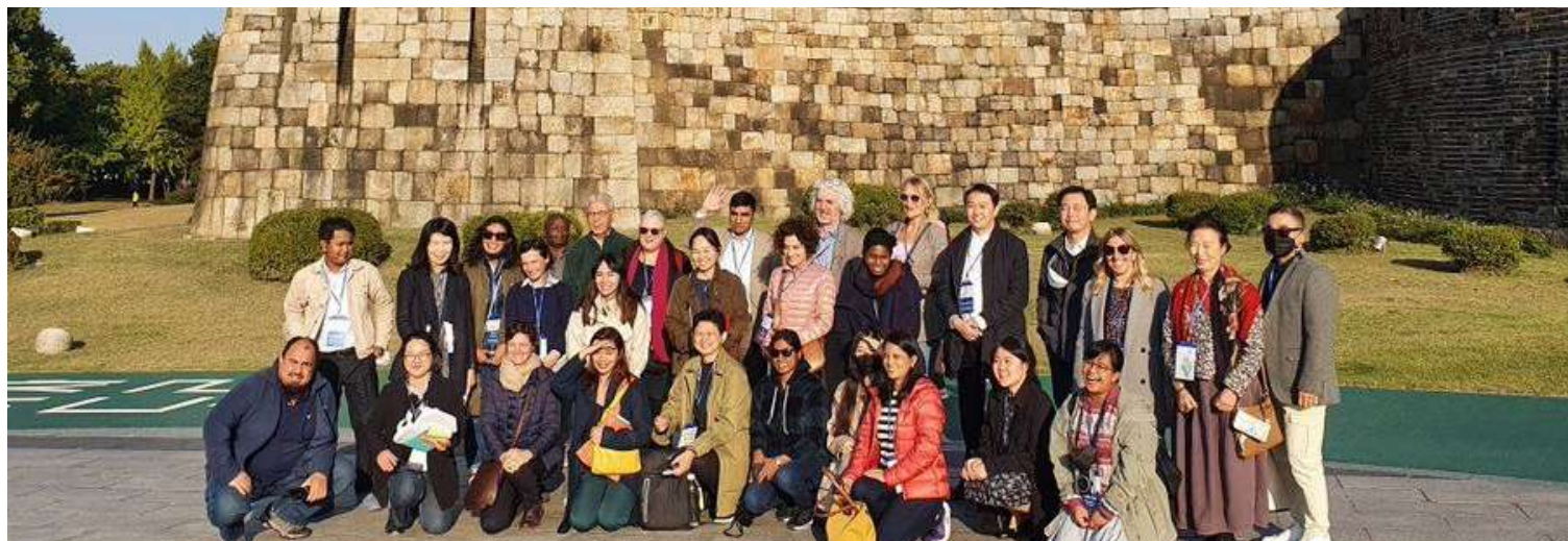
Family photo of the participants of the People Nature Culture Forum 2022

From 10 to 12 October 2022, heritage professionals, academics and heritage institutions gathered in Suwon, Republic of Korea, to participate in the People-Nature-Culture 2022 Forum (PNC Forum) under the theme: "The Benefits of Heritage". Jointly organized by the International Centre for the Study of the Preservation and Restoration of Cultural Property (ICCROM), the International Union for Conservation of Nature (IUCN), the Cultural Heritage Administration of Korea (CHA), and the Korea National University of Cultural Heritage (KNUCH), the PNC Forum celebrated the conclusion of the 2017-2022 Korea-ICCROM Funds-in-Trust, the imminent conclusion of Phase I of the World Heritage Leadership Programme (WHLP), and the 50th anniversary of the World Heritage Convention.