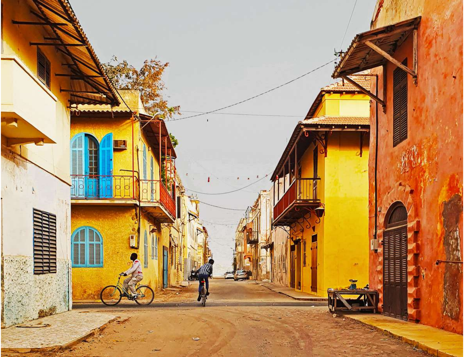
Old town of Saint-Louis