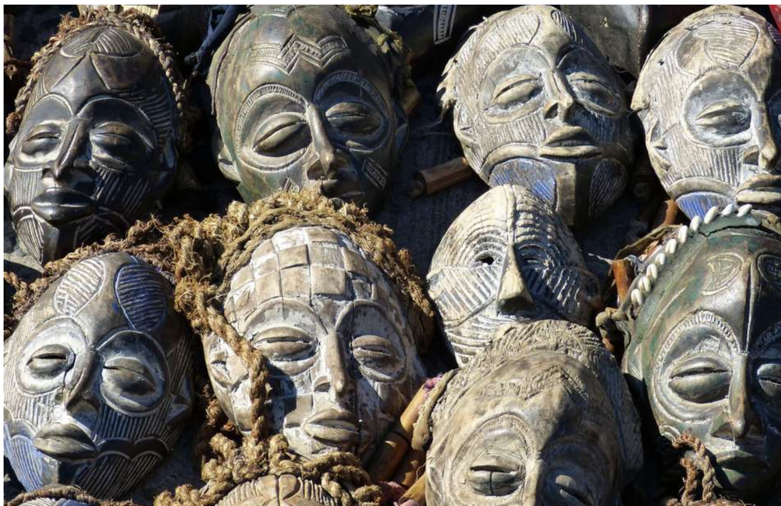
Series of South African wooden masks