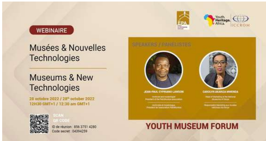
Webinar Museums & New Technologies