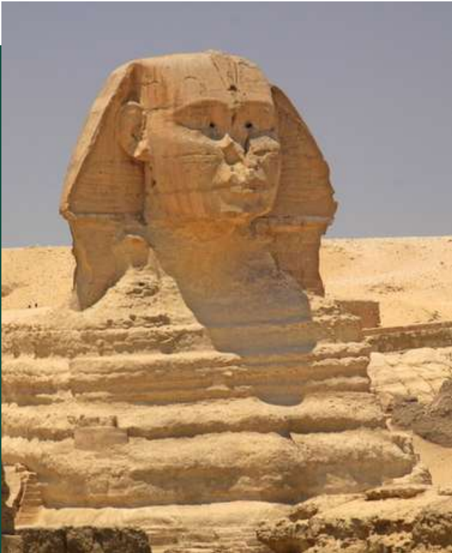
Giza Sphinx © Geoffrey Whiteaway. 2021

TheMuseumsLab aims to build strong and sustainable networks not only to change museums, but also to foster social change by addressing pressing issues. To apply, https://tinyurl.com/54vxt98j . Deadline: 07 November 2022.