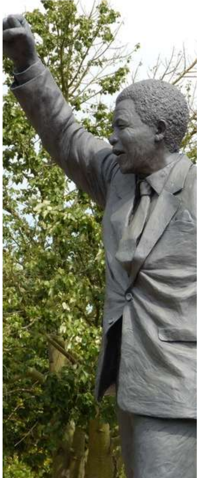
Nelson Mandela Pong Lévé - Cape Town © Falco. 2021