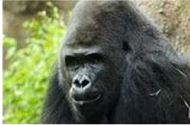
DJA Wildlife Reserve

A UNESCO World Heritage Site since 1987, the Dja Wildlife Reserve is a natural site that was created by Decree No. 319 of June 26, 1950, to create a wildlife and hunting reserve in the Ntem and Haut Nyong regions and supported by Decree No. 2077/1029/PM of July 9, 2007, to create the Dja Reserve. Located in the southeastern part of Cameroon, precisely between the departments of Dja-et-Lobo and Haut-Nyong, the site is bounded at the 3/4 by the Dja River which forms its natural boundary. Responding to UNESCO Criteria (ix) and (x) due to its great biodiversity as well as to the animal and plant species it contains, which allowed it to be recognised as a "Biosphere Reserve" under the MAB label in 1981, the reserve is one of the largest rainforests on the Continent, with an area that is estimated at 526,000 000 ha. With the National Parks of Odzala-Kokoua in the Republic of Congo and Minkébé in Gabon, they constitute the TRIDOM (La Trinationale du Dja, Odzala et Minkébé).