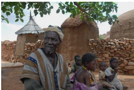
3- Dogon Village Elder with Children © Emilio Labrador/Flickr.

000189 - Construction with sisal cement. anon. Nairobi, UNCHS, 1981. p. 4, illus. (Habitat Technical Notes. 1) (eng). Incl. bibl.