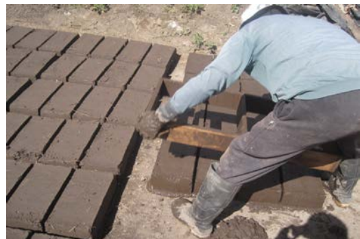
2- Fabricación de Adobes.

PRIMARY KEYWORDS: adobe; building techniques; pise;