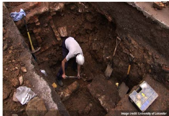
5- Archaeologist at work.

004566 - International colloquium on "Earth construction technologies appropriate to developing countries". Brussels, 1984. Earth construction primer. Houben, Hugo; Guillaud, Hubert. Louvain, Centre de Recherches Architecturales, 1984. 361 p, plans, maps. (Earth construction primer. 8) (eng). Incl. bibl.