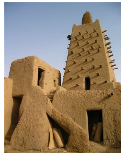
1- Djingareyber Mosque, Timbuktu.