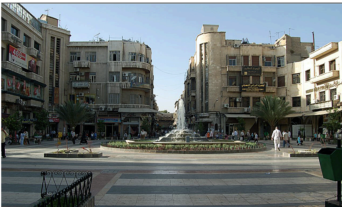
Damascus. Al Hariqa district in 2008 - Abdulac

The exclusively modern commercial reconstruction of the district has reduced the integrity and authenticity of the city. Furthermore, the orthogonal frame of the district is not only completely foreign to the urban traditional fabric, but it seems to threaten it with future extensions. Those designed extensions were still marked with dotted lines on tourist maps of the 1950s, with even a huge road square encircling the Omayyad mosque.