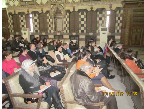
Damascus National Museum. Training course on risk preparedness by ICOMOS-ICORP and ICCROM in January 2013 for about 70 trainees

In November 2014, the 18th General Assembly of ICOMOS unanimously requested that ICOMOS “responds now to the cultural tragedy in Syria and Iraq among its priority areas of activity”. This resolution tasked the Working Group to “coordinate ICOMOS’ activities related to monitoring, studying, communicating, training, assisting and planning for the safeguarding of cultural heritage in Syria and Iraq, as long as the present conflict and its subsequent consequences continue.”