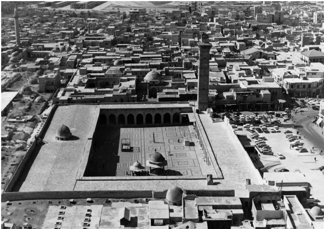
Aleppo. The Omayyad mosque and ancient city in the early 1960s - DGAM