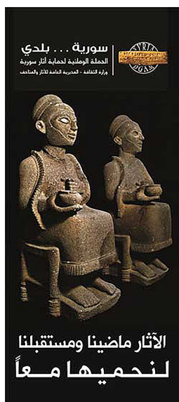
Raising awareness campaign poster by the DGAM

Many stakeholders are involved in the safeguarding of cultural heritage in Syria. Our aim here is not to review them all, nor to assess all their past and present activities. This would need substantial reports to be constantly updated. It is however important to mention the range of actors and their main domains of interest.