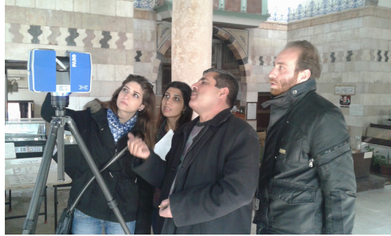
Al madrasa al Jaqmaqia, Damascus. Some ANQA project trainees are beginning their survey exercises, February 2016 – DGAM

No similar large scale urban destruction of historic districts was identified in Iraq. However the damage due to bombardment to over a 100 houses from Fuleiha district in World Heritage Old Sanaa raises serious concerns.