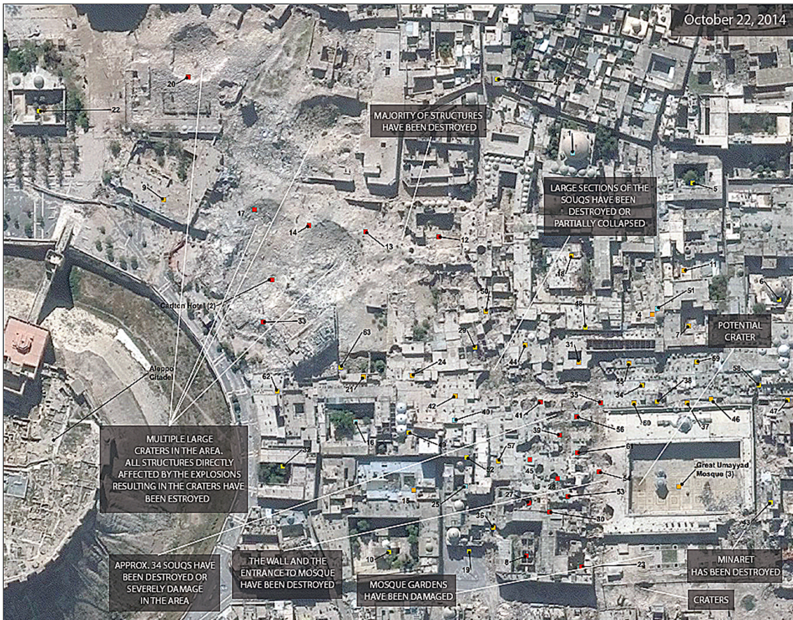
FIGURE 2. Overview of Aleppo and damage to cultural heritage locations.