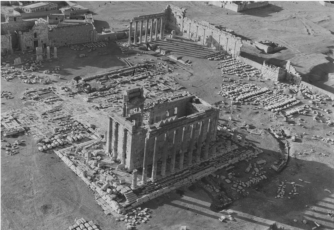
Palmyra; The Bel Temple in the early 1960s - DGAM