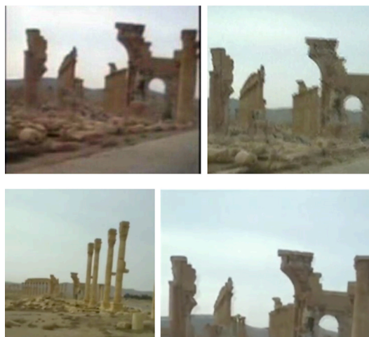
Palmyra. Remains of the triumph Arch, after destruction

In May 2015, after a brief battle, Daesh jihadists took over the city and the archaeological site. The museum was fortunately already mostly evacuated. Contrarily to promises, in August, Baalshamin temple and then the Bel temple cella were loaded with explosives and destroyed. Later on, the same fate happened to some funerary towers and later on to the triumph arch, which never carried any religious significance. Even Moslem shrines and cemeteries were destroyed in the vicinity. Captured government soldiers were executed in the theatre and other persons were attached to columns and dynamited. Illegal diggings were undertaken too. The fate of the site remains threatened by an eventual battle for its liberation.