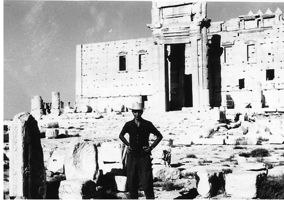
Palmyra. The author at the age of 16 in Bel temple.