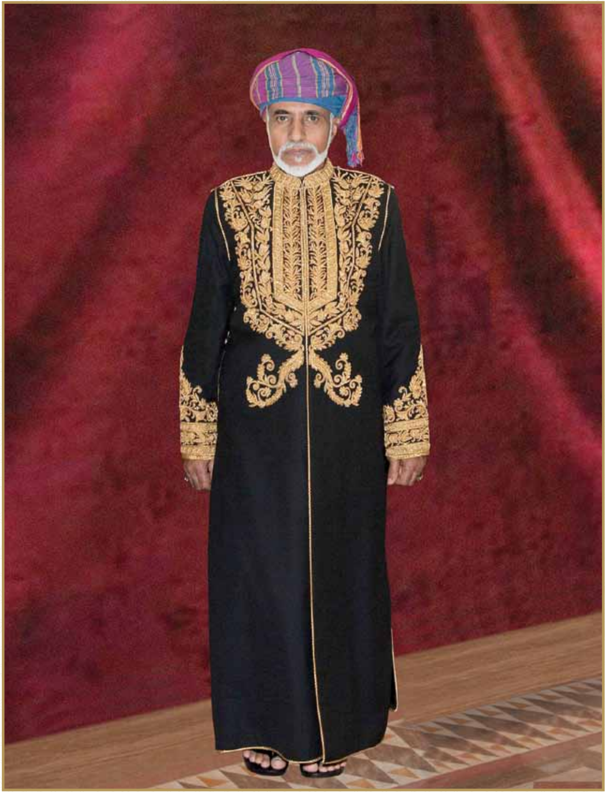
His Majesty Sultan Qaboos Bin Said