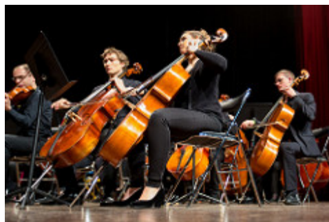
Amphitheater Poincaré of « Ecole Polytechnique »- France