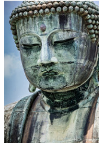
A close up on Kotoka-in's Bouddha-Kamakura-Japan

001757 - Use of collective space in Patan and other historic towns of the Kathmandu Valley, Nepal. Sekler, Eduard F. Louvain, ICOMOS, 1979. p. 97-108, illus., plans, maps. (Monumentum. 18-19) (eng). Utilisation des espaces collectifs à Patan et dans d'autres villes historiques de la Vallée de Kathmandou, au Népal. fre. La Utilización de los espacios colectivos en Patan y en otras ciudades históricas del valle de Kathmandu. spa. Incl. bibl. PRIMARY KEYWORDS: conservation of historic towns; conservation areas; environmental deterioration; squares; temples; town planning; housing standards; world heritage list; financial assistance; tourist facilities; legislation; customs and traditions; Nepal.