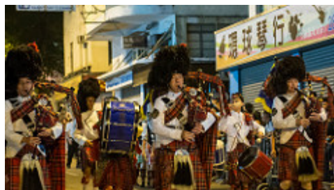
Fire dragon dance-Tai Hang-China