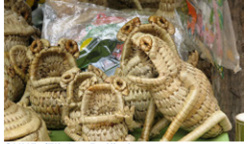
Raffia frogs- Ambohimanga-Madagascar

003629 - Tecelagem : Centro Nacional de Artesanato, uma experiência de 4 anos. 79 p, illus. (por).