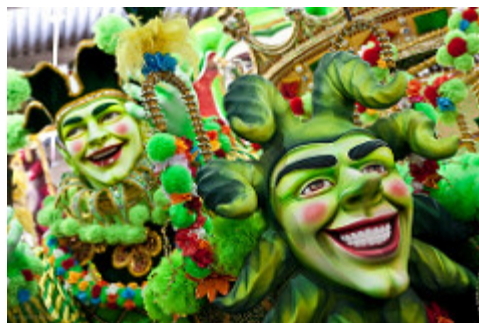
Carnival in Rio de Janeiro, Brazil.